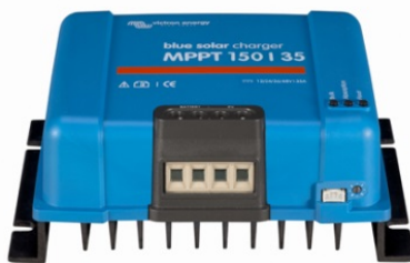
Solar Charge Controller MPPT 150/35