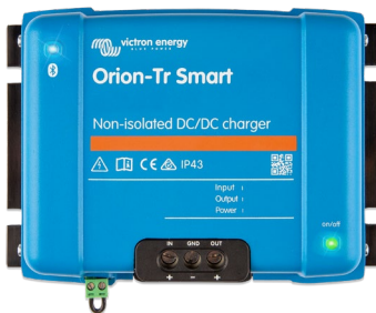
Orion-Tr Smart non-isolated 12/12-30