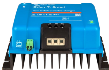
Orion-Tr Smart non-isolated 12/12-30