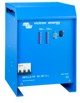
Skylla TG 24 50 3 phase