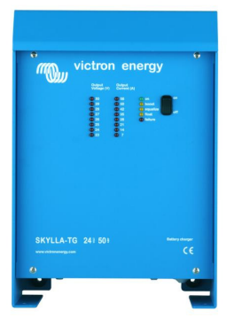
Skylla TG 24 50