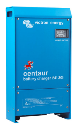
Centaur Battery Charger 24 30