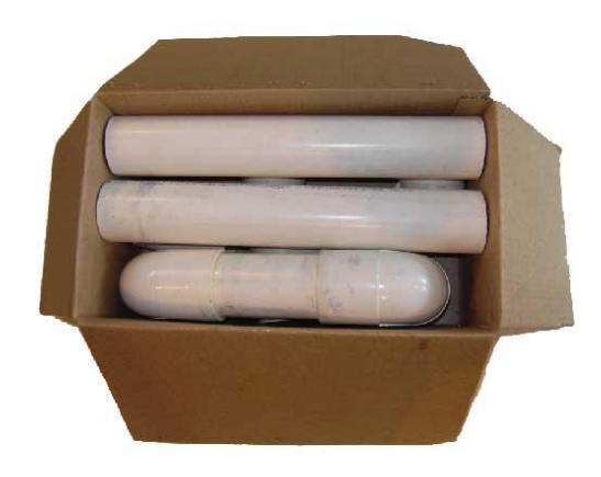
Manifold boxed for overseas customers

A fitting can be supplied to connect your pipe line for an extra charge