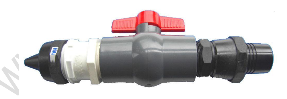
PS070-PS074 – 1 unit without a pressure gauge PS070-PS075 – 1 unit with a pressure gauge (gauge supplied to suit your maximum water head).