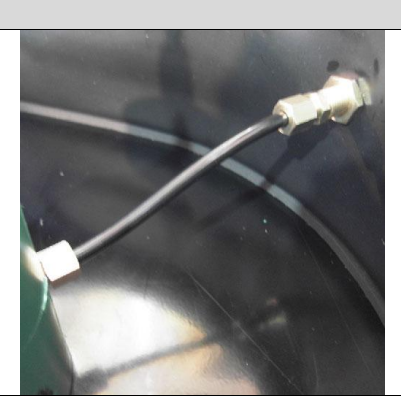
PS091 – PS094 Grease lubrication system