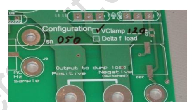
PS100 ME or GE voltage limiting plastic coated circuit board You must state whether you require 100,120,140, 250, or 450 VDC when ordering these boards. Voltage limit (Vclamp) is written on each board (see picture above right)

PS102-PS103 Water element PS1004 wire links the two components together.