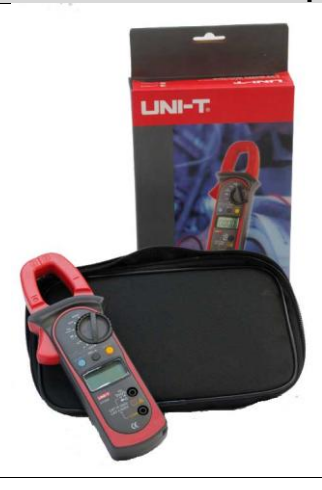
Sub 11 - Optional extras: DC clamp meter

Please note this item is no longer needed as we have modified our injection mold to make jet inserts from 2mm upwards, these you can easily cut on site