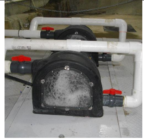
Manifold assembled on turbine