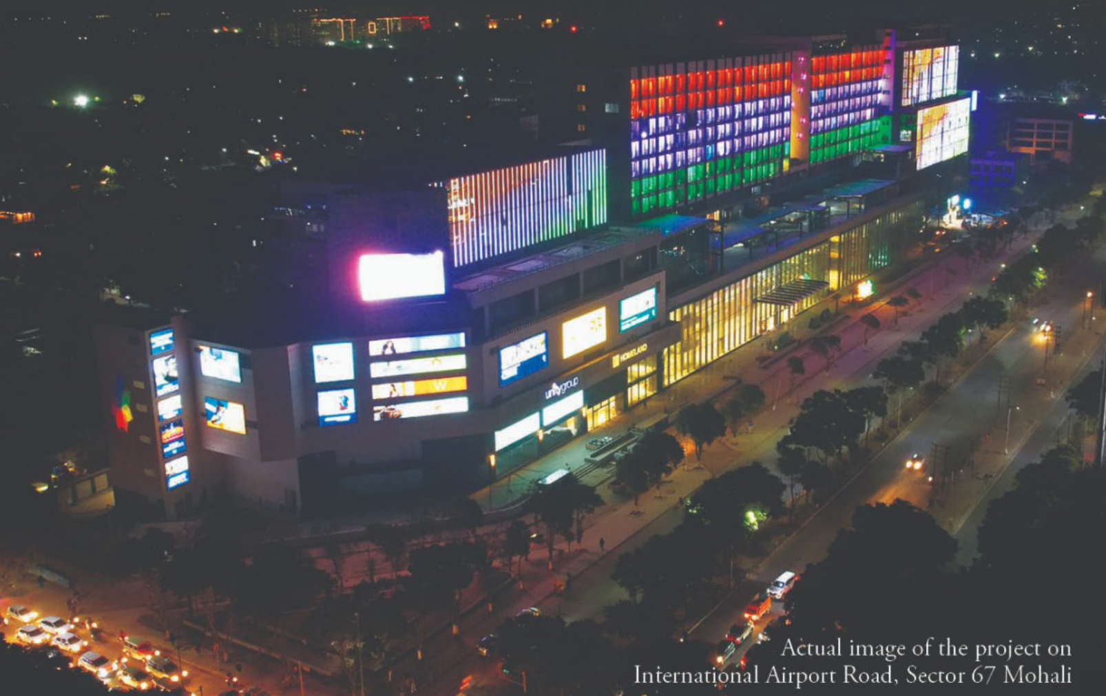
Actual image of the project on International Airport Road, Sector 67 Mohali

On Cover: CP67, a collaborative masterpiece by Unity Homeland Group