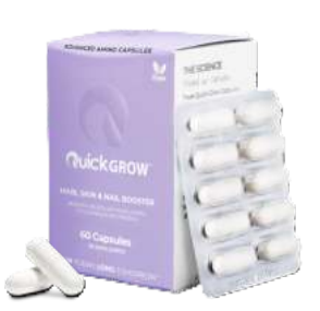
Hair Growth Capsules