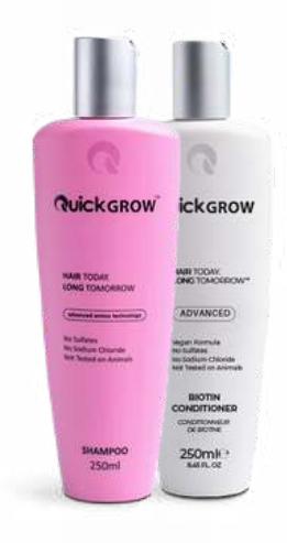
Biotin Shampoo & Conditioner