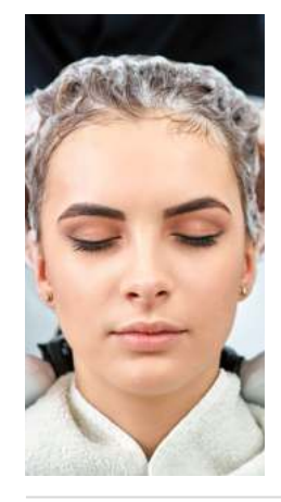
STEP 1: Cleanse

The Quick Grow advanced smoothing treatment protects and smooths hair using bioidentical keratin, which has the same molecular composition and 19 amino acids found in human hair. It forms a permeable keratin mesh around each hair's cuticle to protect it from damage, breakage, and moisture loss. It also smooths down the outer cuticle to restore lustre, elasticity, and shine, without losing your hair's natural movement.