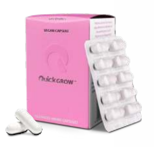
Hair Growth Capsules