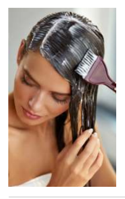
STEP 2: Treatment Application

First the hair is gently cleansed using a pH 6 clarifying shampoo. This does not affect the existing surface keratin or any applied colour.