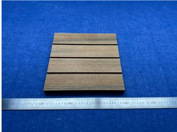
Front view (Test surface)