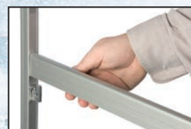
Tool free assembly