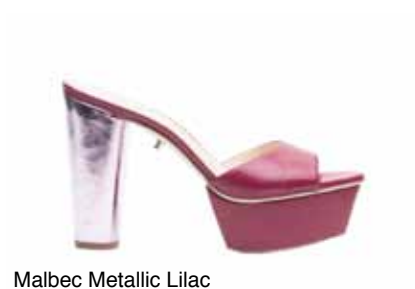
Malbec Metallic Lilac

Our Resort/Winter 2016 collection looks back to the glittering nightlife of the 1970's. Muted classic lifts with hints of glamorous glitter, rich metallics and luscious pony hair. Who said disco was dead?