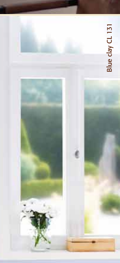
conlino colours of clay