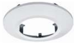
Recess Mount(Indoor Only)