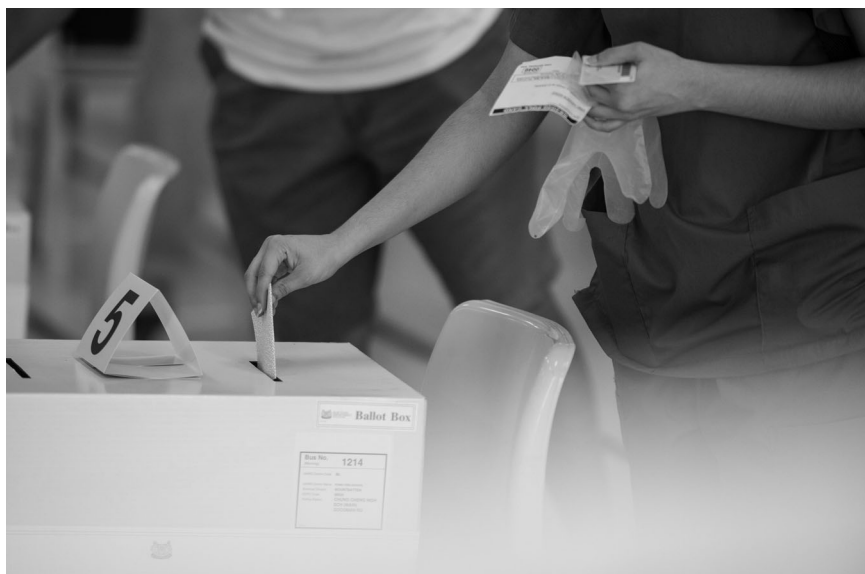
At the ballot box.