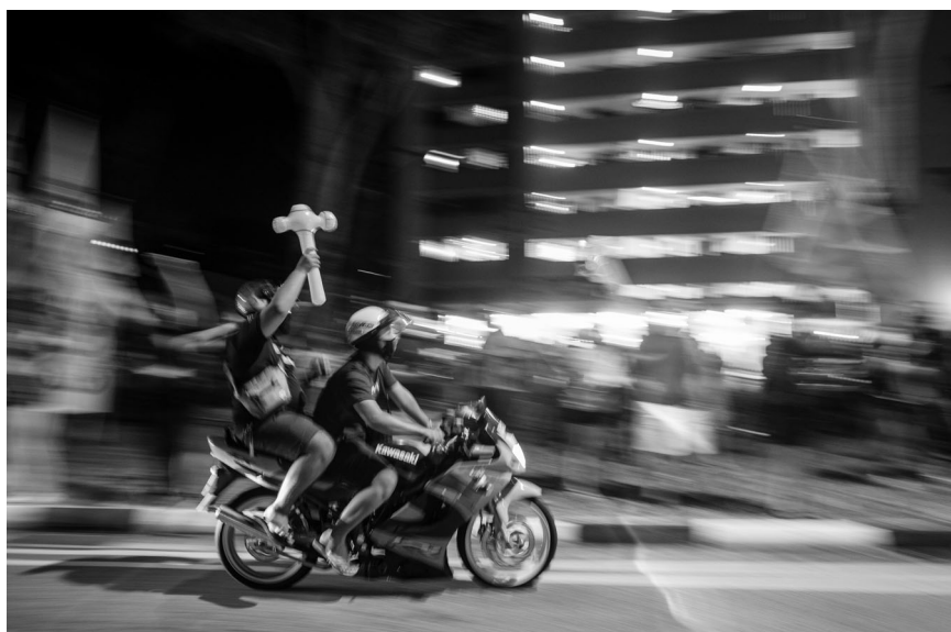
Celebrations in Hougang.