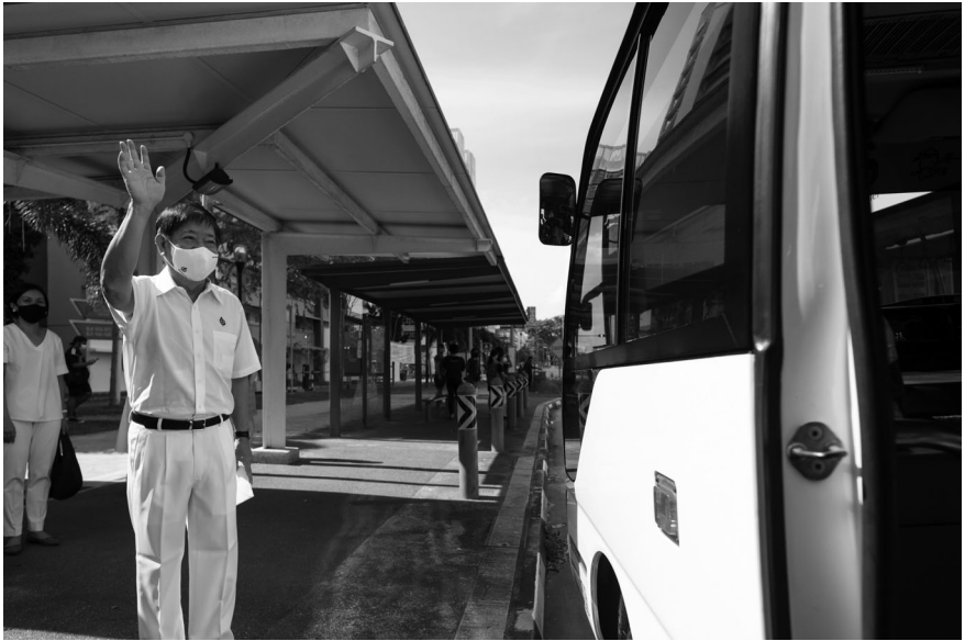
Khaw Boon Wan's last wave to Sembawang as a politician.