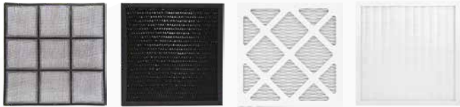
NFS16 WASHABLE NYLON MESH FILTER CF16 ACTIVE CARBON FILTER PF16 PLEATED MEDIA FILTER HEPA50 HEPA FILTER

FILTER CHANGE LIGHT Indicates when filter needs to be cleaned or changed.