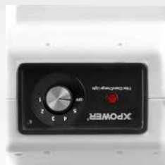
5 Speed Control Panel