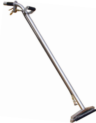
Scrubber Squeegee Wand