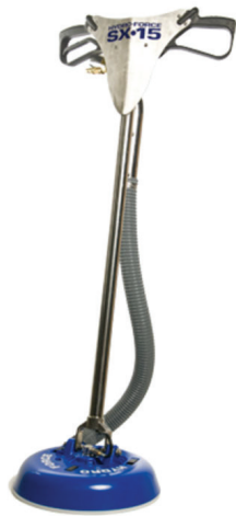
SX-15 Cleaning Tool