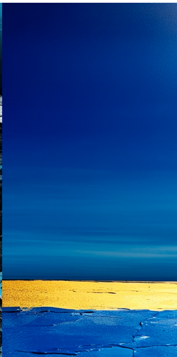
Golden Sea 01 - Dallanges Blue Contemporary Art (Partial)