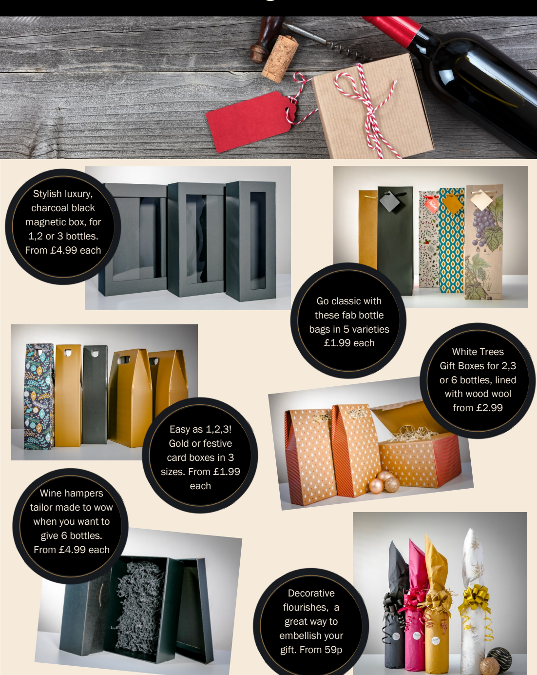
Free local delivery on orders over £50