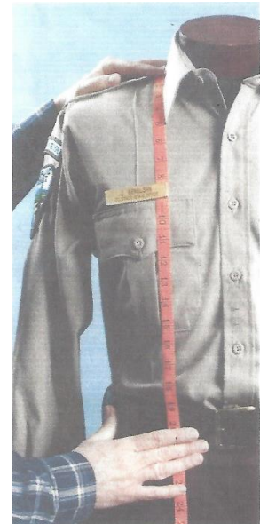
#5: Measure from the center top of the shoulder seam to the top of your belt.