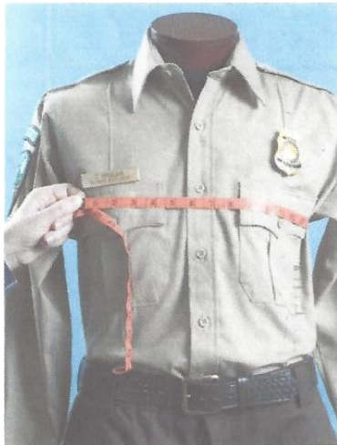
#3: With arms at your side, measure under your arms all the way around the widest area of your chest.