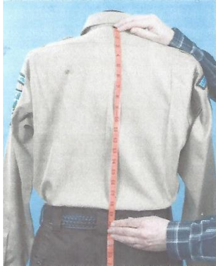
#1: Measure from the base of your collar seam to the top of your duty belt.

Phone: (909) 794-2435 | Fax: (909) 794-4033 | E-mail: sales@bpstactical.com