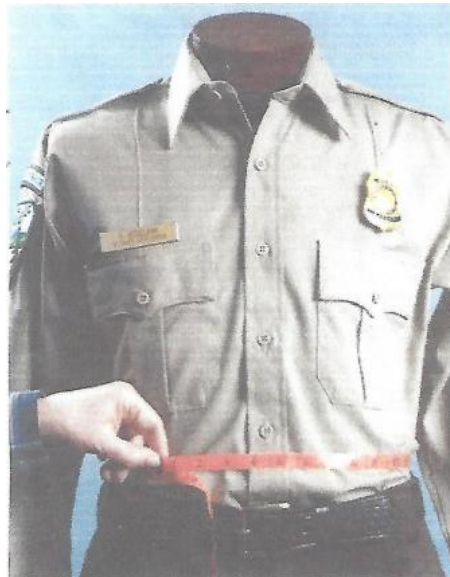
#4: Measure all the way around the widest part of your waist just above your duty belt.