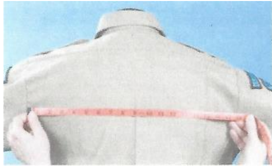
#2: With arms straight out the side, measure from shirt sleeve seam to shirt sleeve seam across the mid-shoulder base.