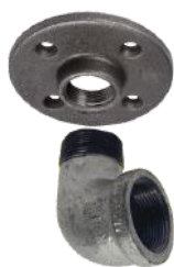
Flange 90° Elbow

Purchase 3/4" threaded Galvanized Steel or Black Iron Pipe and fittings from your local hardware store to create a mounted pipe to thread the net's loops through. See suggested pieces below for a cargo net 4' wide, mounted into the ceiling.