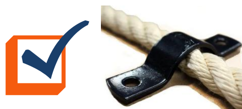
Flushmount Anchors (No screws)