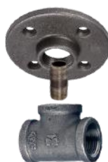
Flange 2" Fitting Tee Joint Fitting