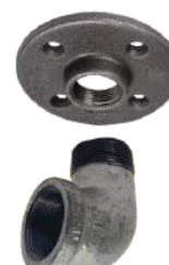
Flange 90° Elbow