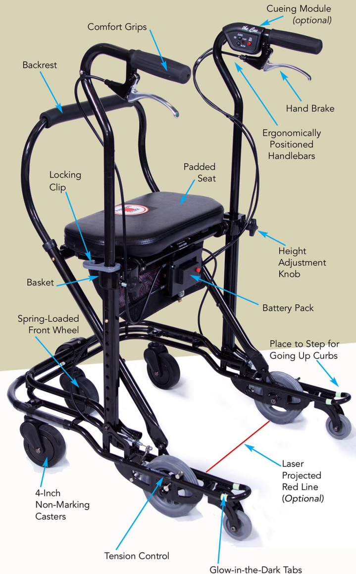
Model #: US-PC2