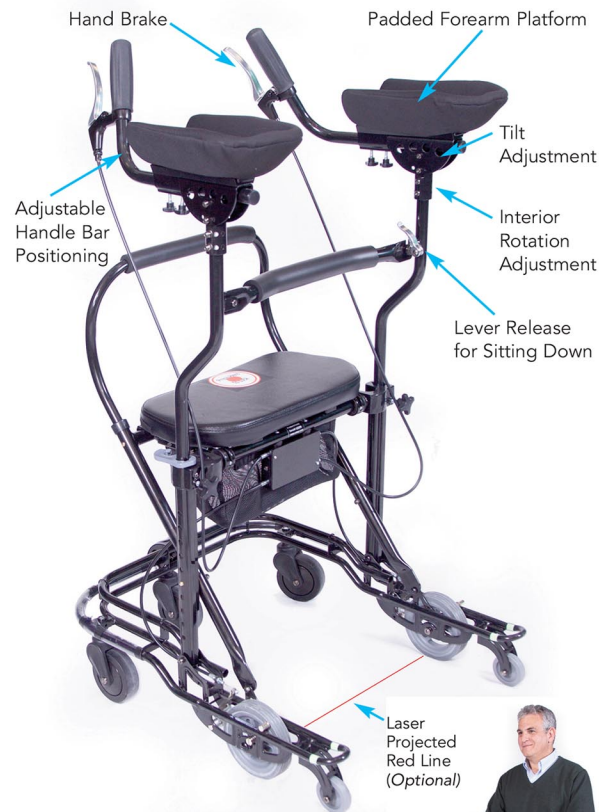
Model #: US-PC2-PL

Ideal for Stooped Posture, weak upper body, stroke, brain injury. Highly adjustable for optimal setup.