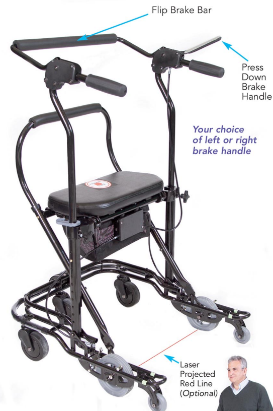
Model #: US-PC2-PD

Ideal for those with weak or no hand strength to squeeze a standard hand brake. To go, press down on the brake handle or the flip bar. Choose left or right brake handle.