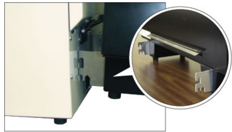
Shows the hooks on the InkConnect

Connect the InkConnect's serial port to the embosser's serial port with the provided serial cable.