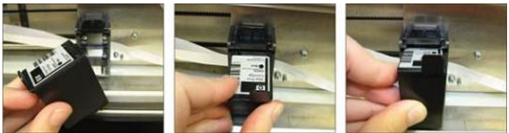
Shows how to insert an ink cartridge

holders by placing the nozzle end in first and then pressing the side with the tab forward into the InkConnect until the cartridge snaps into the holder.