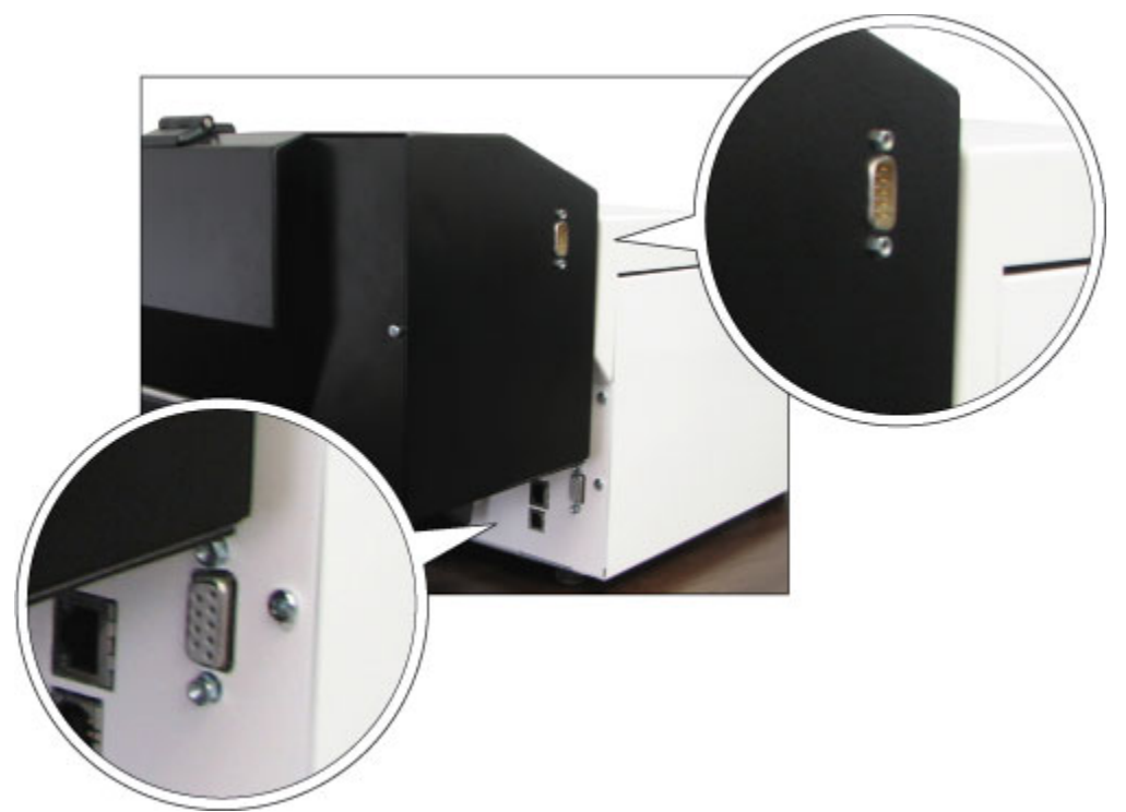
Shows the locations of the serial port connectors on the embosser and ink attachment