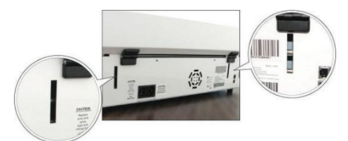
Shows the locations of the pegs in the back of the embosser

To attach the InkConnect to the embosser, line up the hooks on the InkConnect with the pegs in the back of the embosser. Insert the InkConnect hooks straight into the embosser and lower the InkConnect onto the embosser pegs.