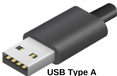
USB Type A

* The Apple USB or equivalent 2.1A power adapter should be used for charging. (The type of USB Cable used (USB Type A or USB Type C) is dependent upon on the existing power adapter that is supplied with the iPad.)