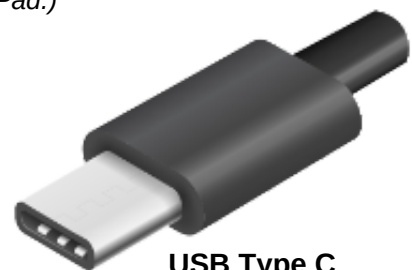
USB Type C