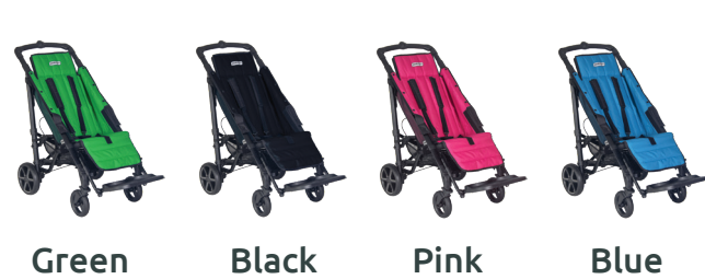
Green Black Pink Blue