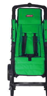
The Seat Inlay allow to fit small children from two years of age.