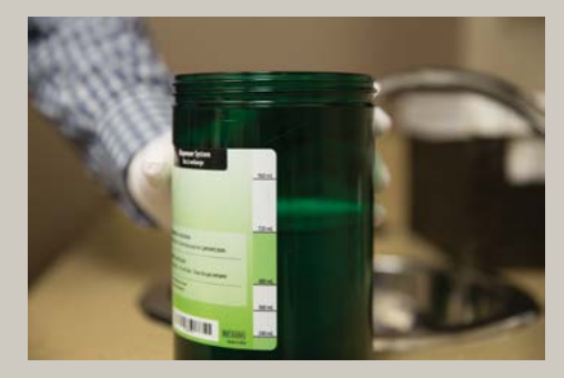
3. Fill to 720 ml