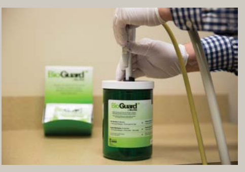
4. Attach suction handpieces...DONE!