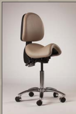
Seat Back (Up Position)