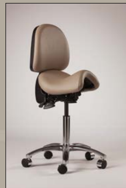
Seat Back (Down Position)