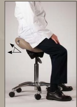
Back Position Tilt