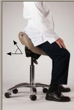
Forward Position Tilt