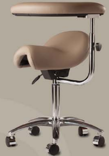
Bambach Saddle Seat without Back Shown with optional assistant arm armrest