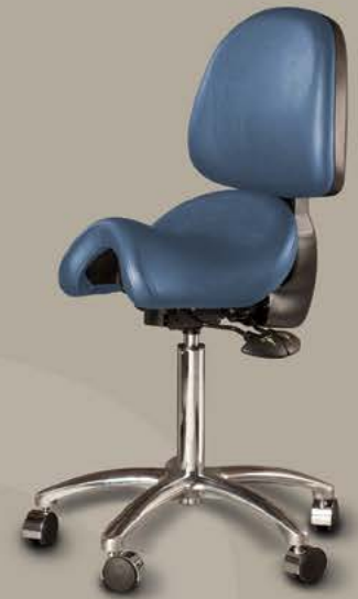
Bambach Saddle Seat with Back Shown without optional footring

This completes the installation of the Bambach Saddle Seat with back assembly. Please read the "Adjustments" section for more details on how to get the full functionality from your stool.