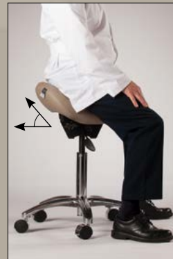
Mid Position Tilt