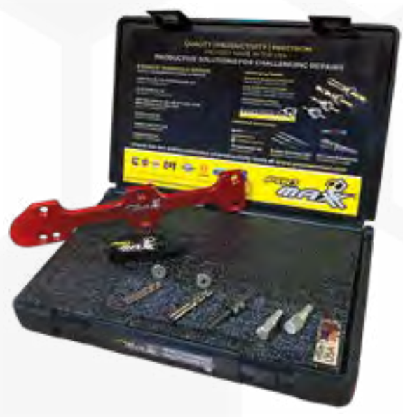
Ford 6.7L Power Stroke Broken Exhaust Manifold Repair PMXP200PRO