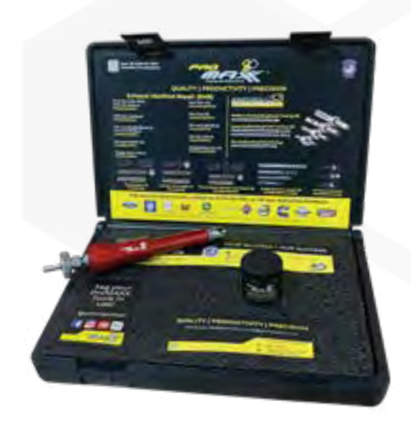
Ford 6.7L Power Stroke Fuel Injector Seat Repair PMXRBY300PRO