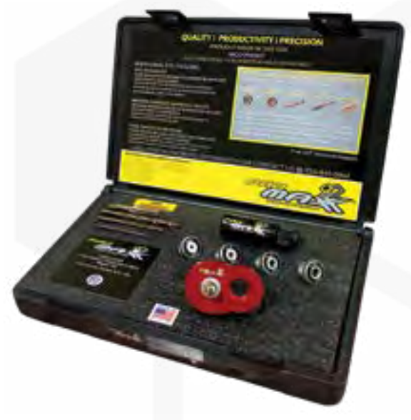
Ford 6.7L Power Stroke Fuel Injector Hold Down Bolt Repair Kit PMXO200PRO