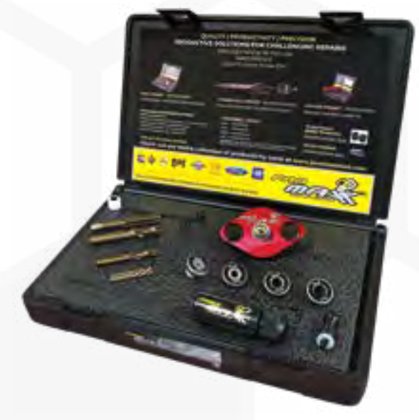
Ford 6.7L Power Stroke EGR Repair PMXN200PRO