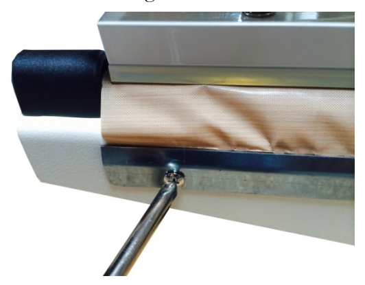
Figure 1. Loosen screws on PTFE plate.