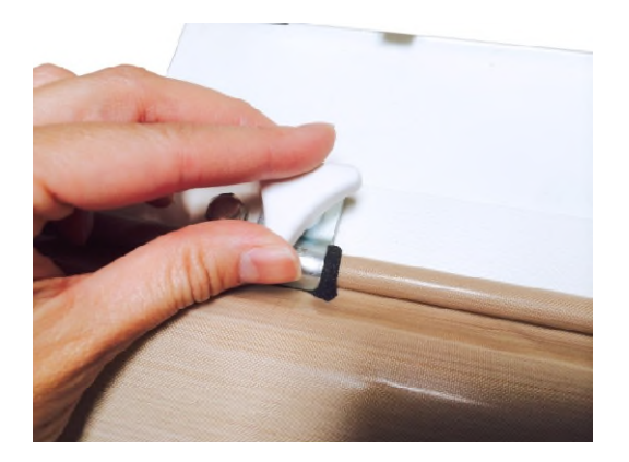
Figure 5. Loosen multi-star knob to remove the PTFE roller.