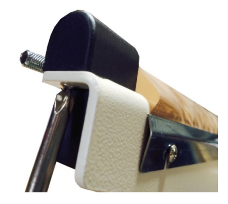
Figure 2. Remove heating element cover