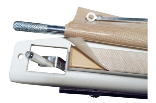
Figure 3. Remove heating element from mounting spring