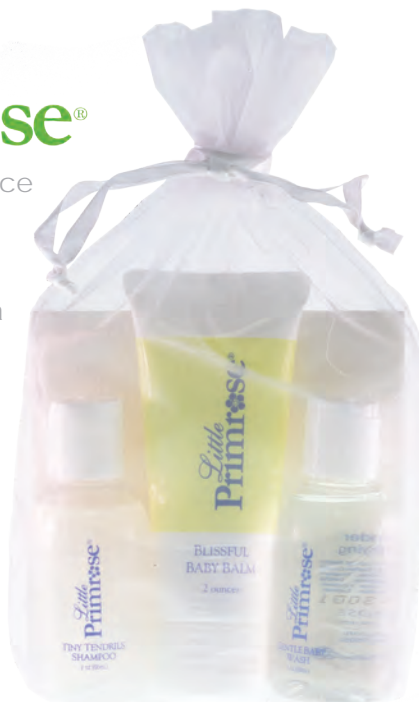
Little Primrose Set 2 oz 19-00100 set has a shampoo, baby wash and baby balm in an organza bag

Little Primrose fragrance is an absolute delight for the little ones. Special and sweet, this scent embodies a delicate blend of tiny blossoms, soft citrus and leafy greens.