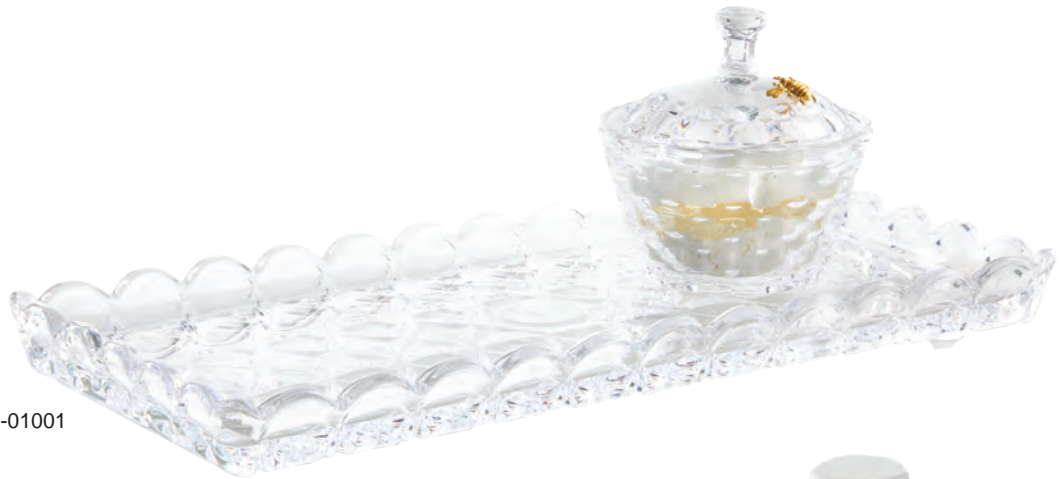
Scalloped Vanity Tray 13.5 x 6.75" 22-01001

The finishing touch to your display, and to sell to your customers with a grouping of our beautiful products.