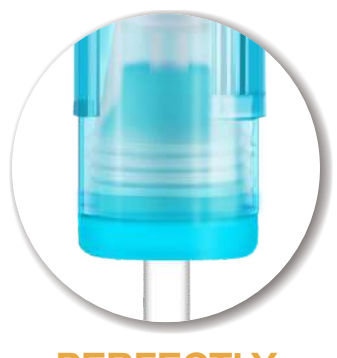
PERFECTLY FIT PEN