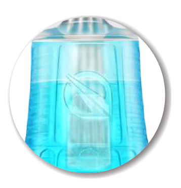
UNIQUE JCONLY LOGO