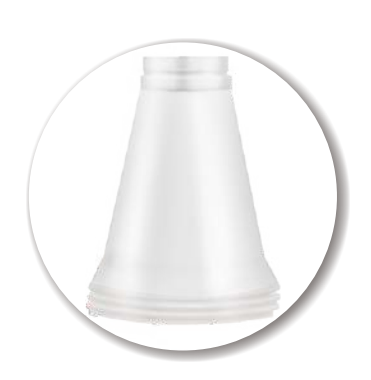
SAFETY MEMBRANE DESIGN