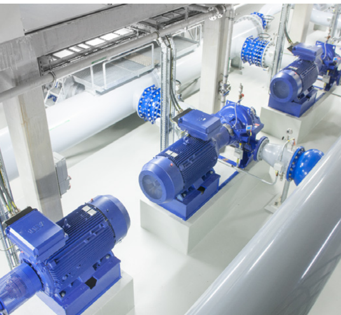
Evides Waterbedrijf has used installed SynRM pump and drive packages with energy savings estimated at 20 percent

For further information, visit https://new.abb.com/motors-generators/iec-low-voltage-motors/process-performance-motors/synchronous-reluctance-motors .