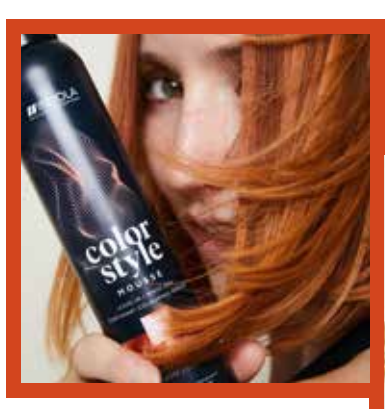
Created with: Color Style Mousse Copper