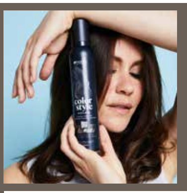
Created with: Color Style Mousse Dark Ash