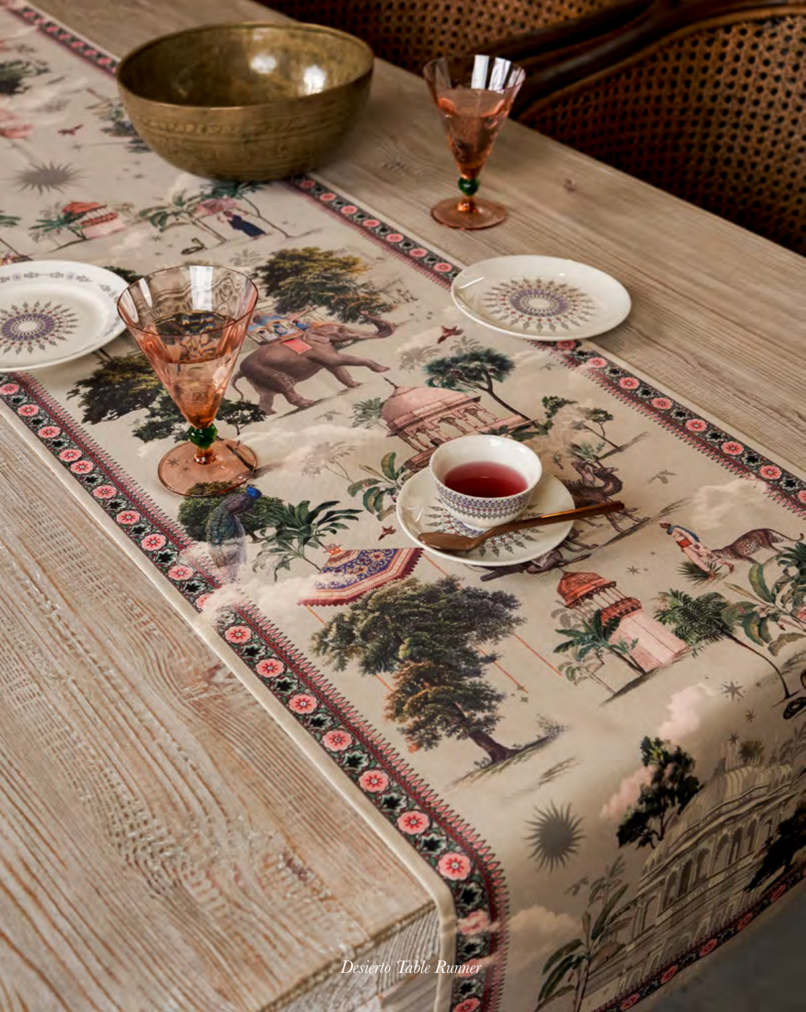
Desierto Table Runner