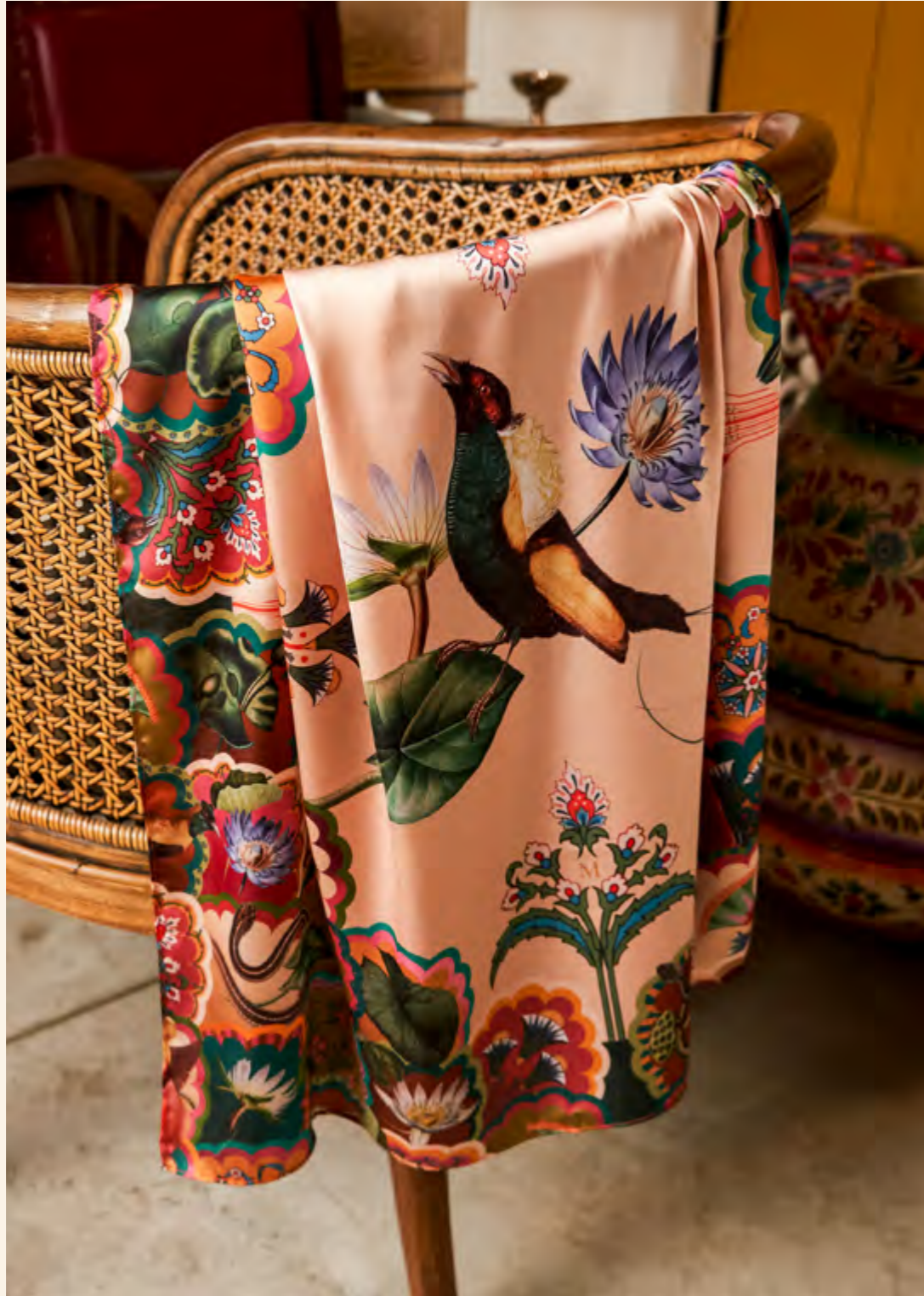
Lotus Silk Sattin Scarf