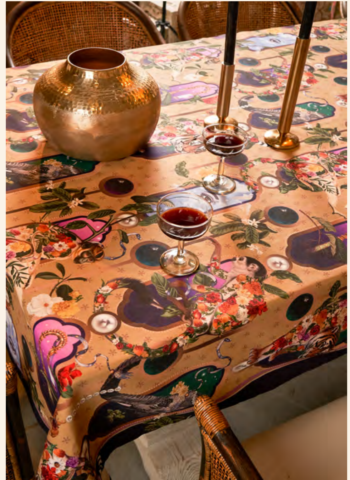
Sand India Tablecloth