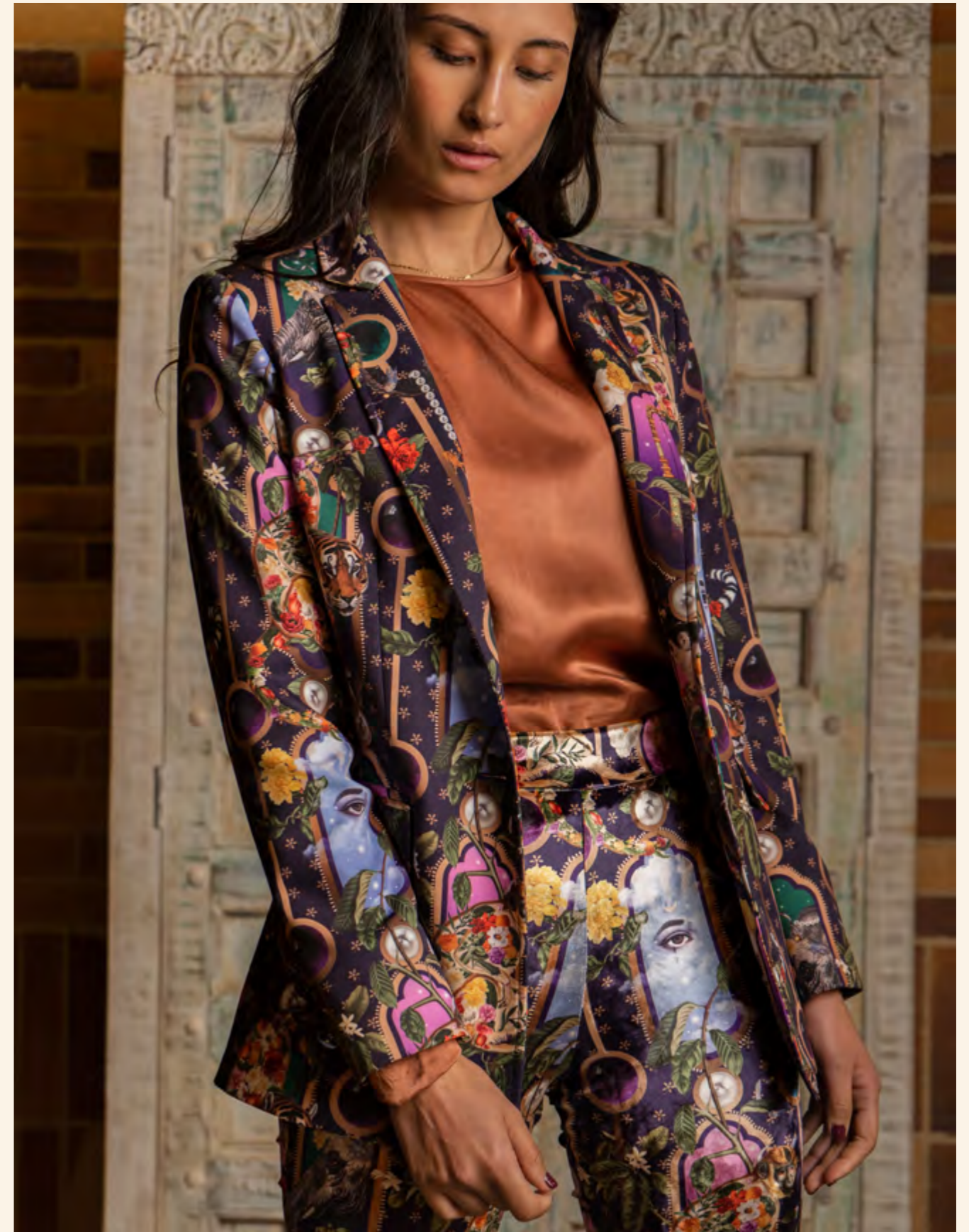
Purple India Blazer