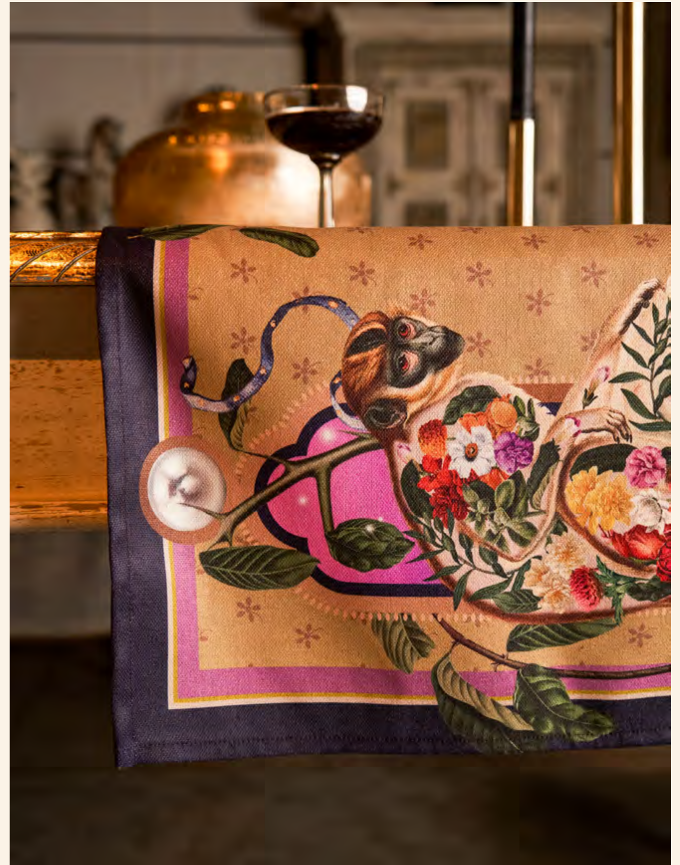
Sand India Table Runner