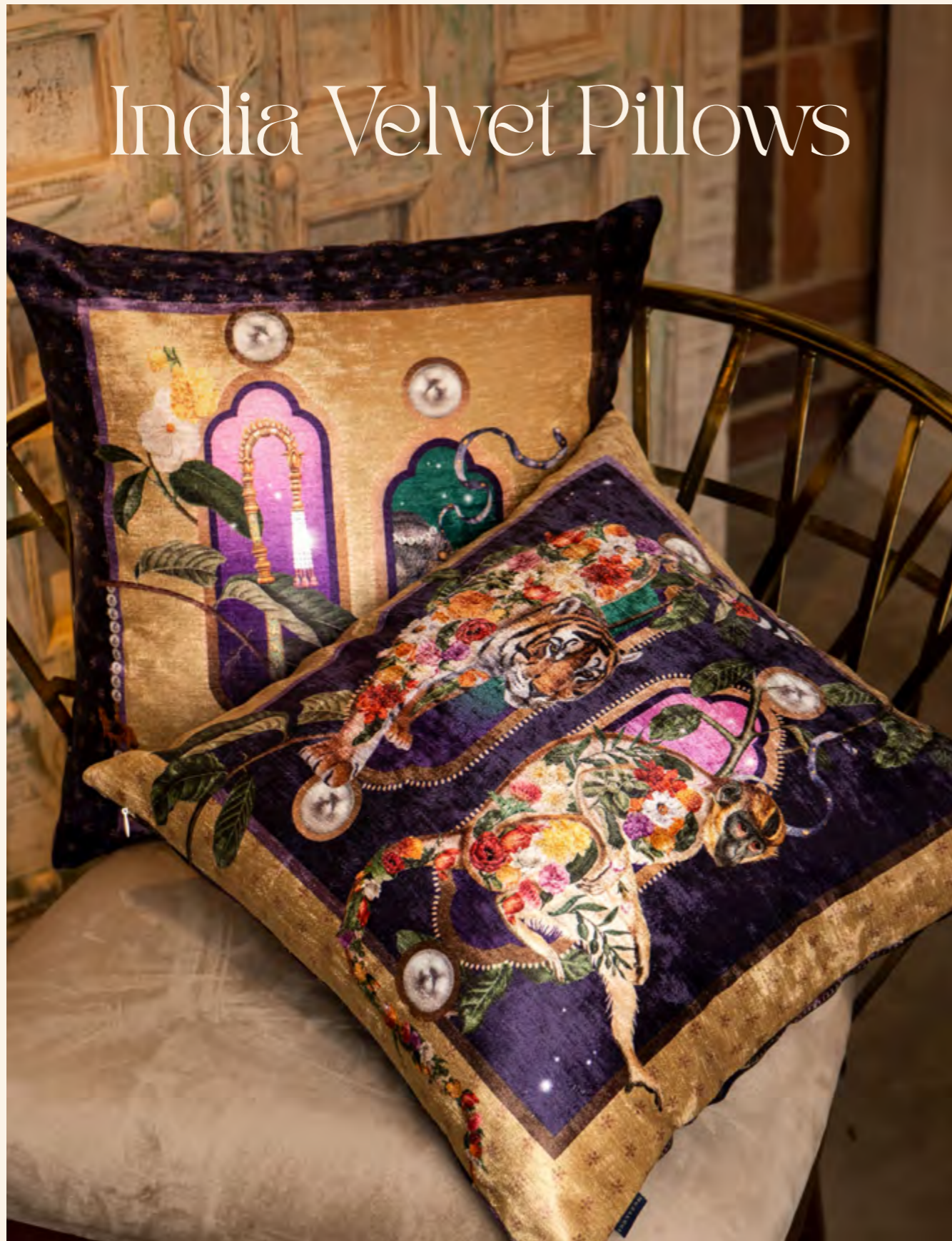
India Velvet Pillows