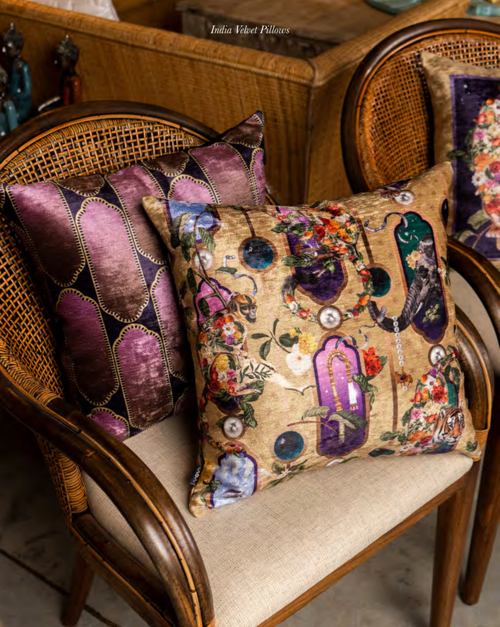
India Velvet Pillows