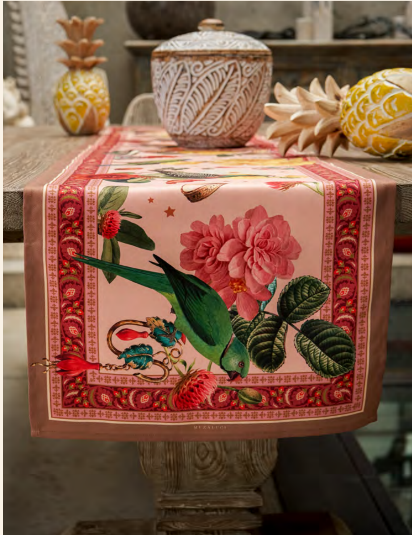
Rama Table Runner