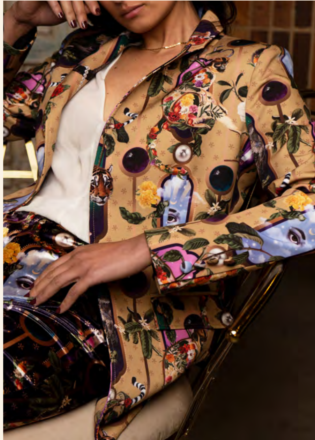
Sand India Blazer