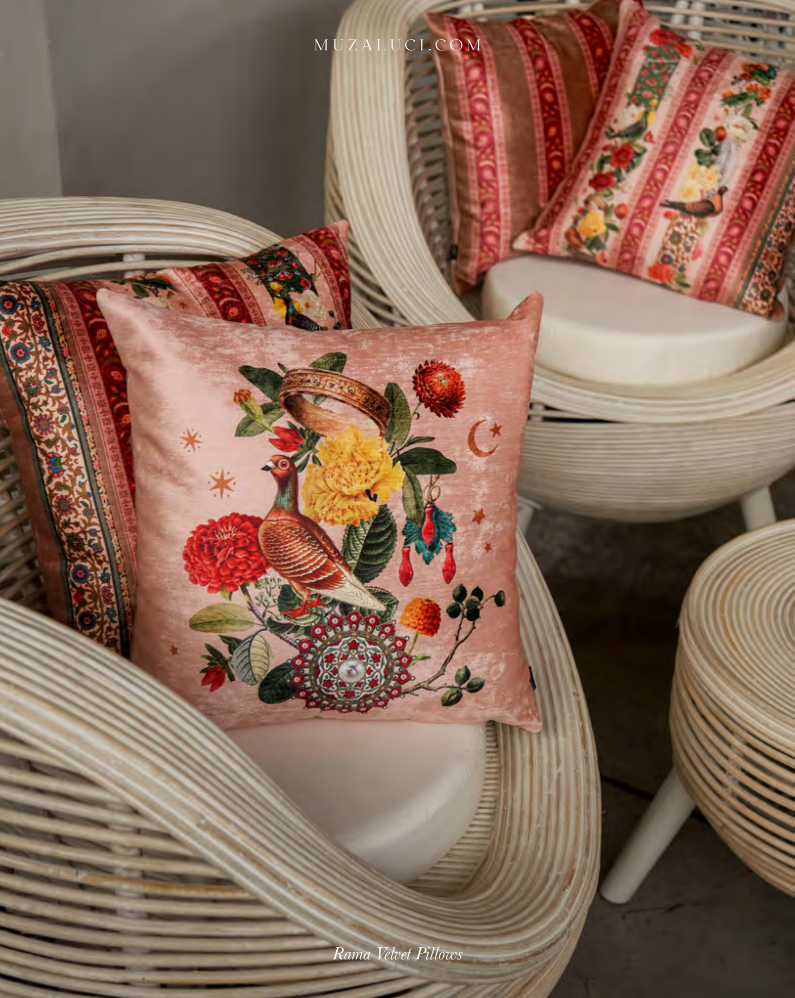
Rama Velvet Pillows