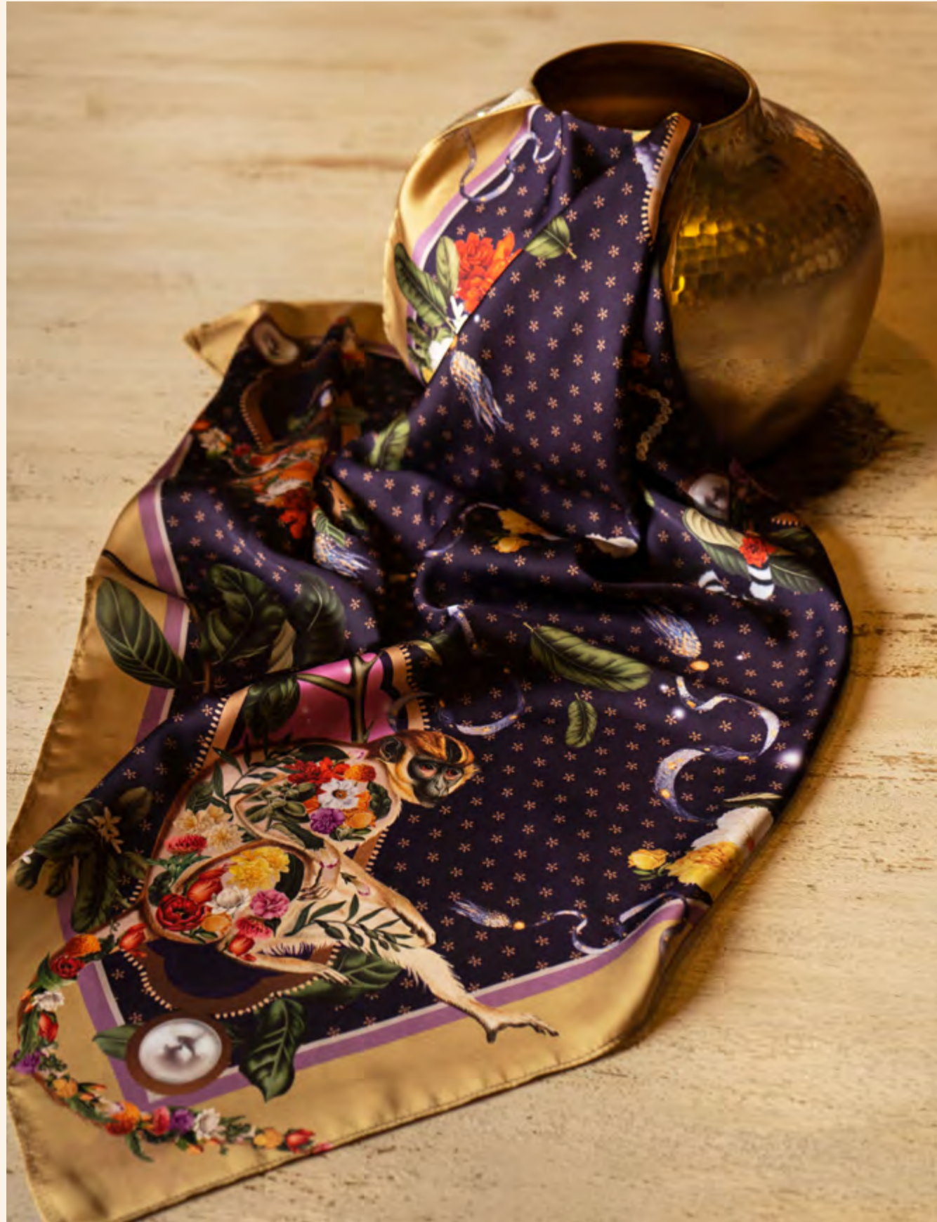
India Silk Sattin Scarf