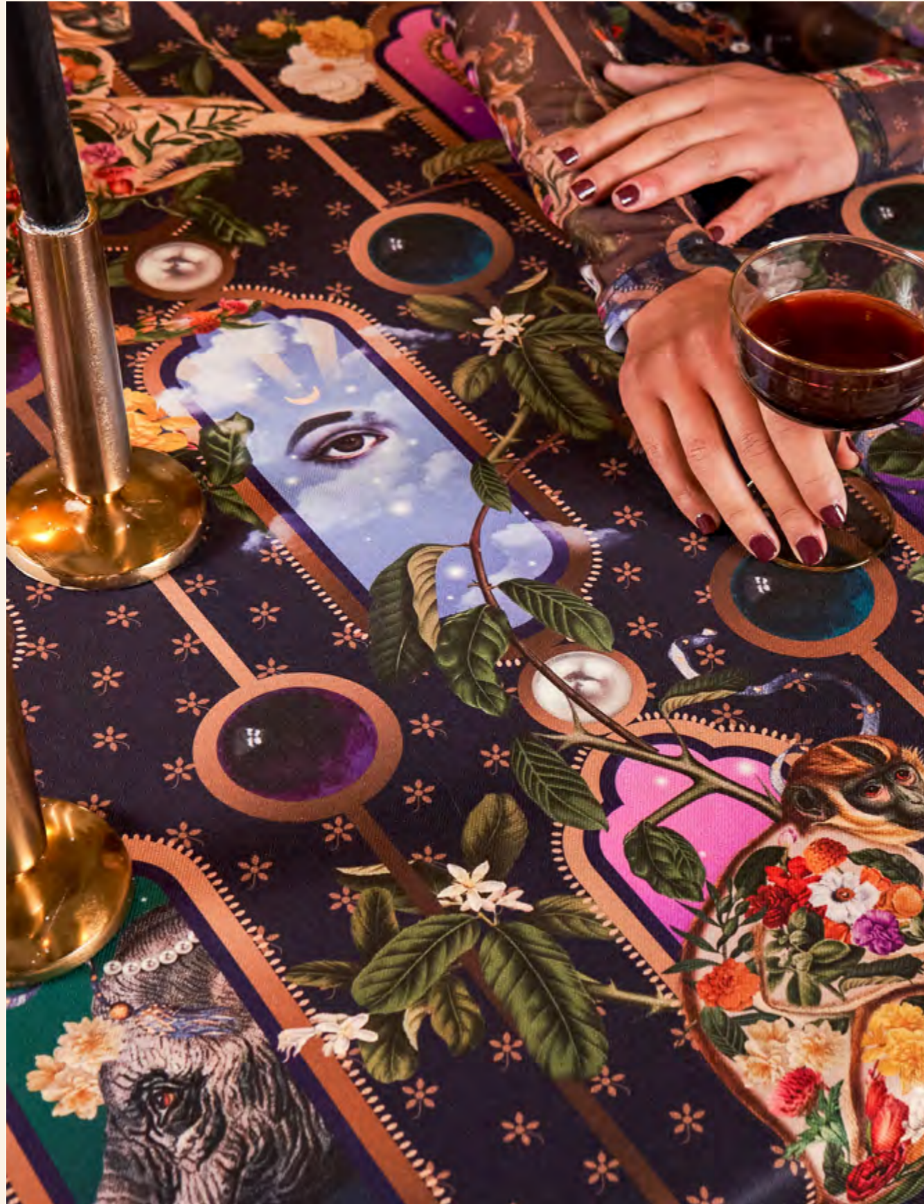
Purple India Tablecloth