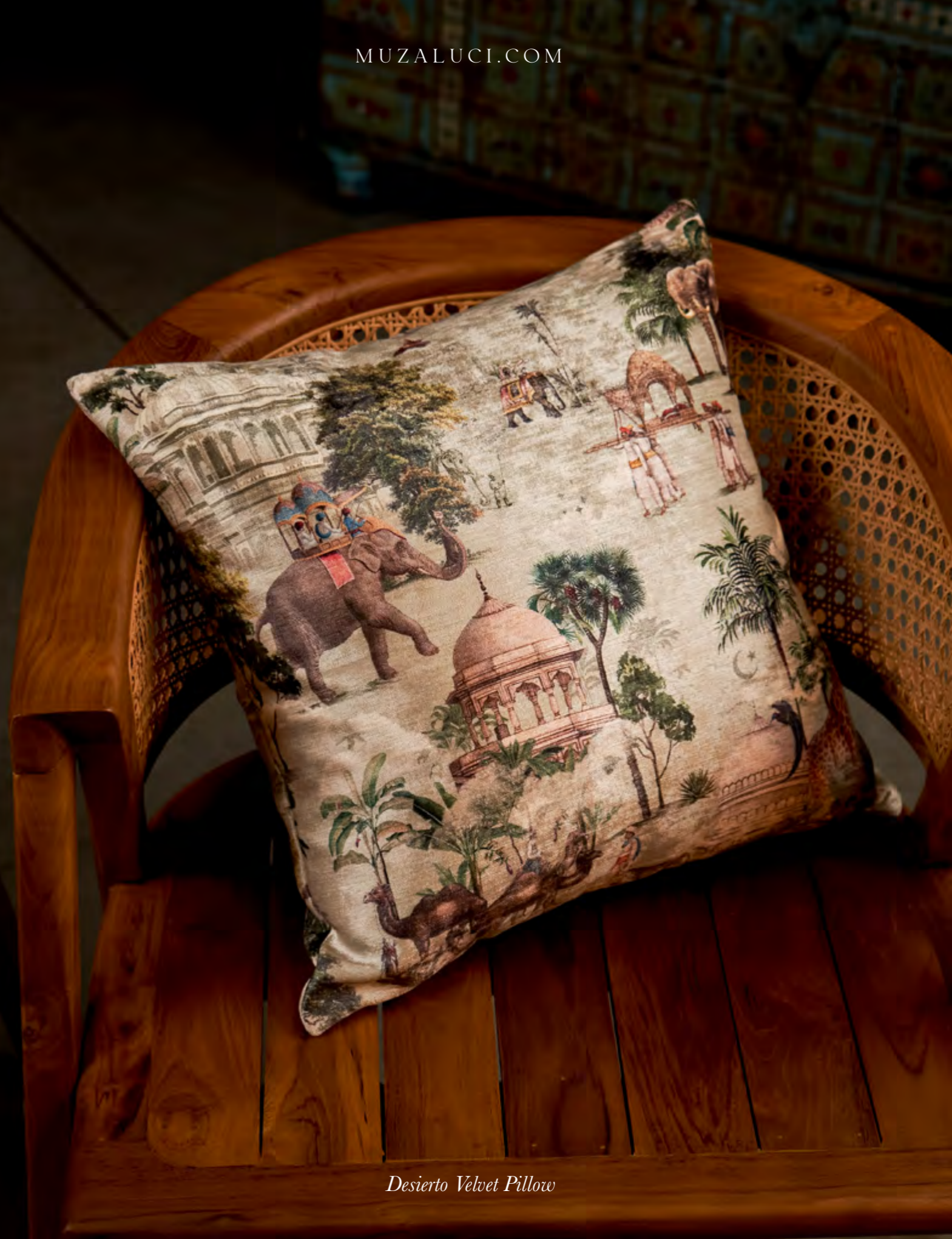
Desierto Velvet Pillow