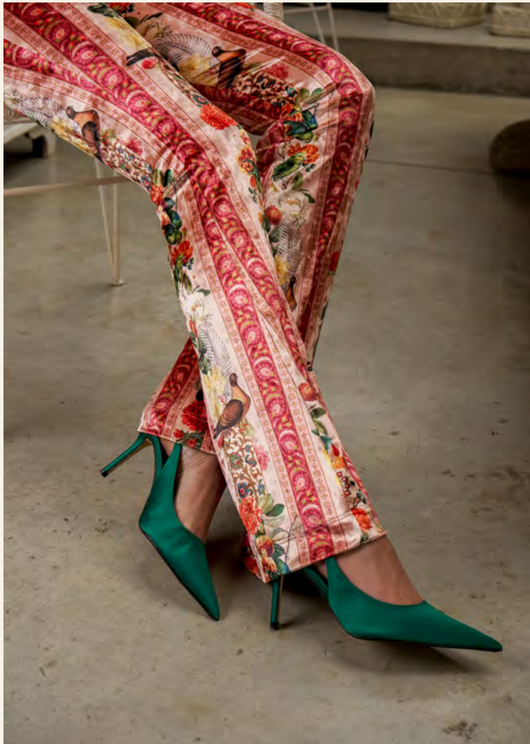
Rama Velvet Plants

Discover the transformative power of art, and let our print be the masterpiece that moves you.