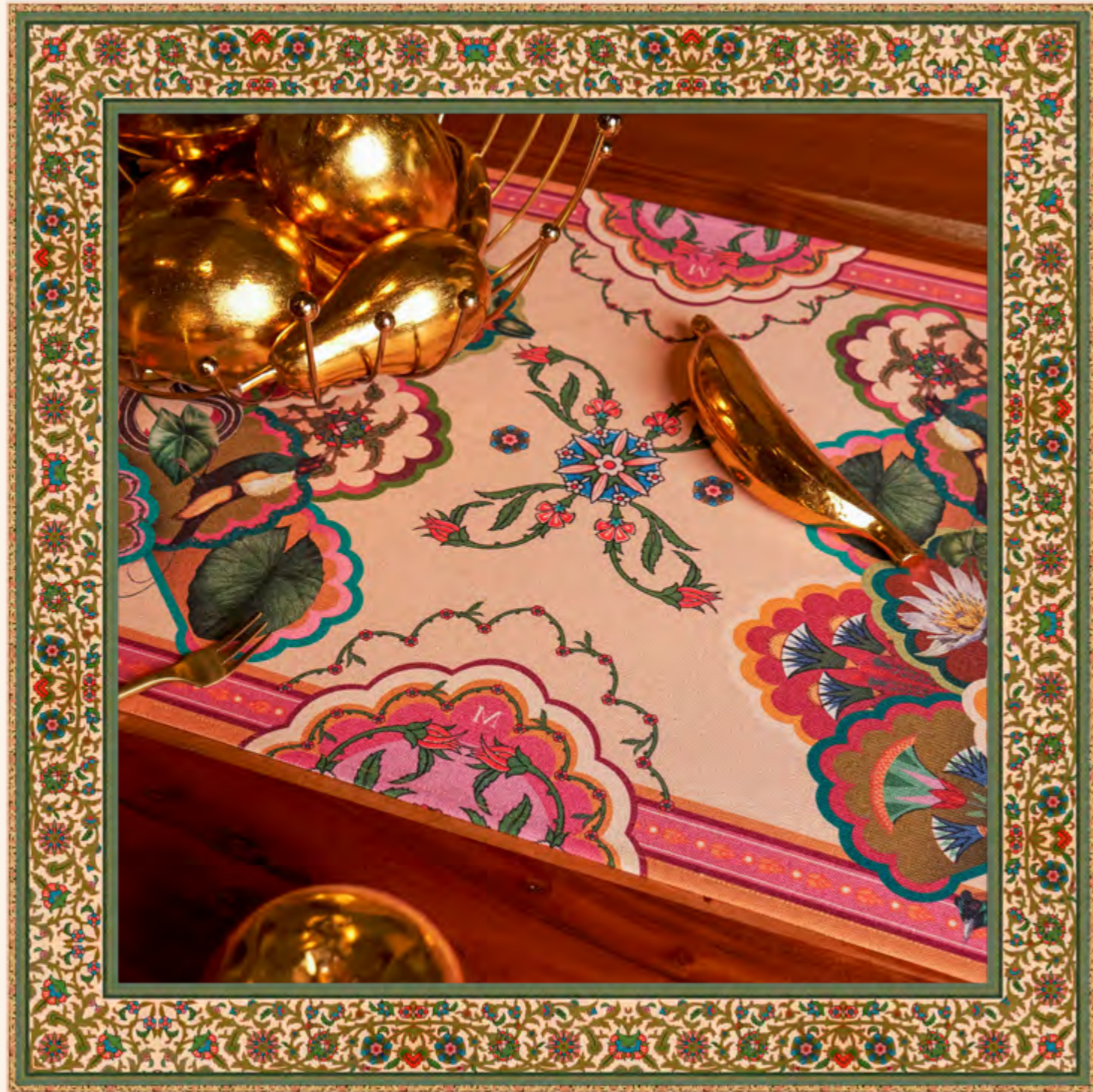
Lotus Table Runner