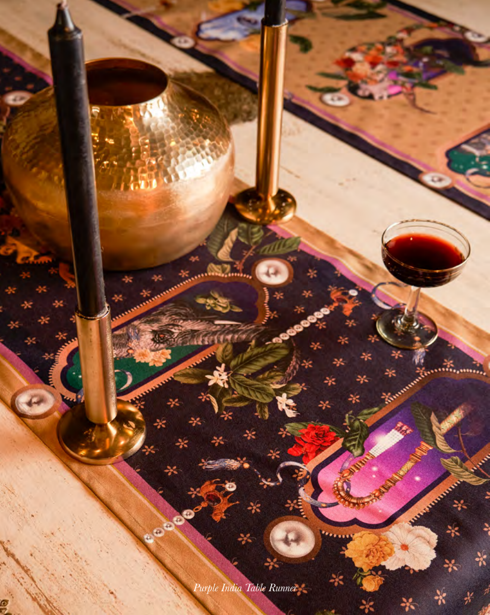
Purple India Table Runner