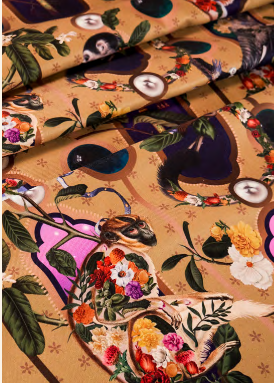
Sand India Tablecloth