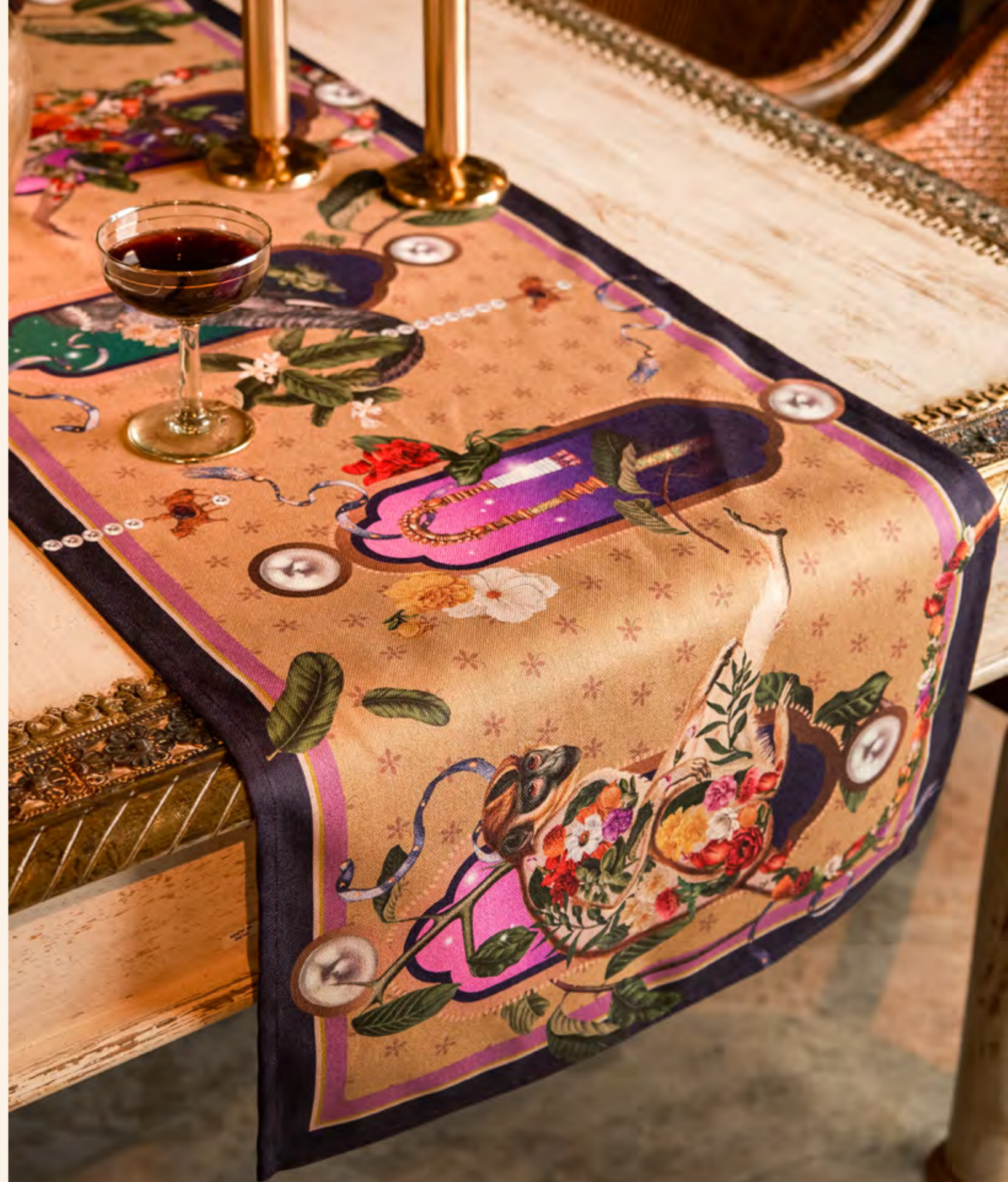
Sand India Table Runner