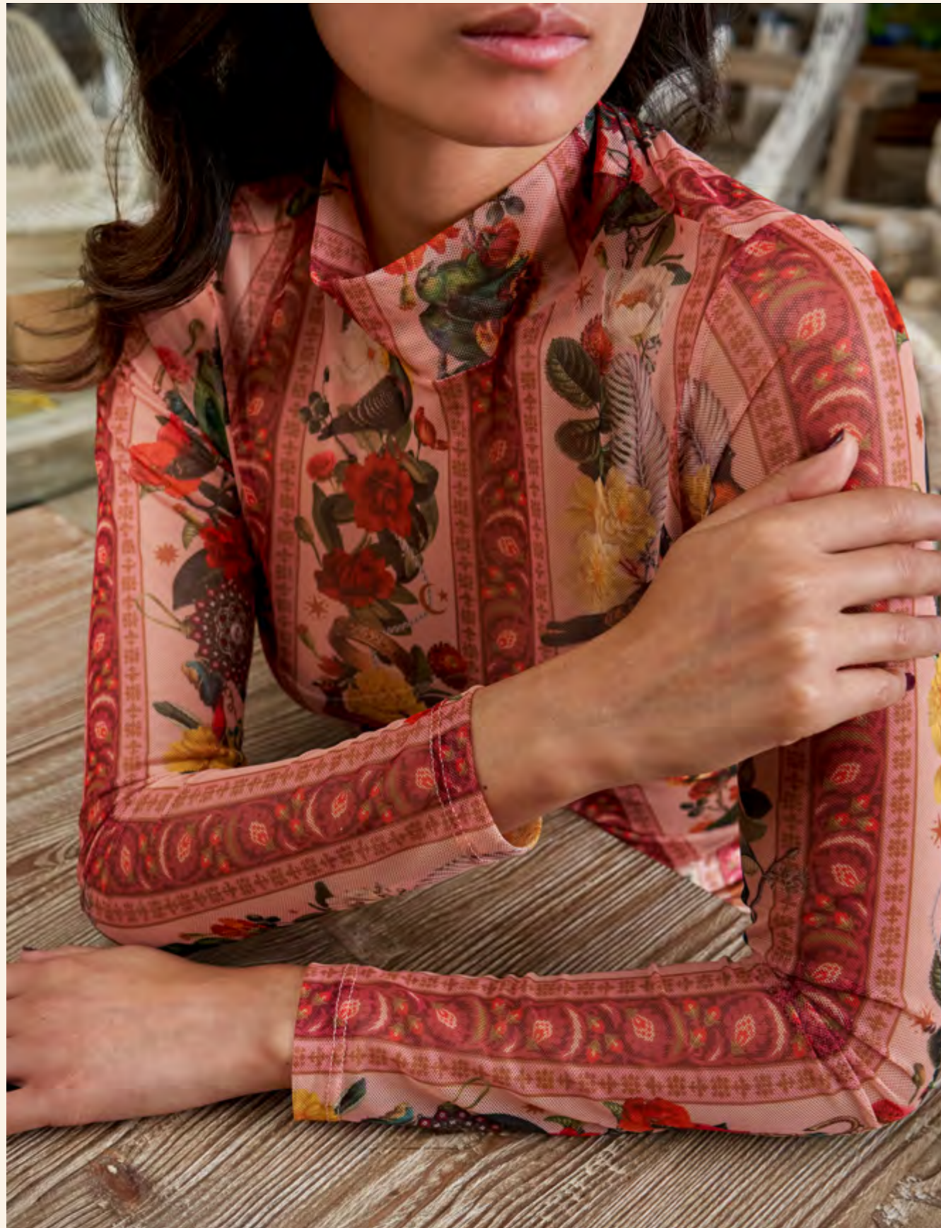
Rama Mesh Blouse