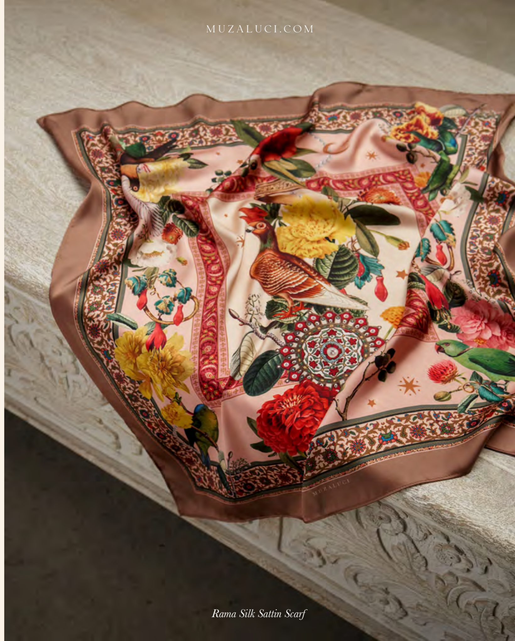
Rama Silk Sattin Scarf