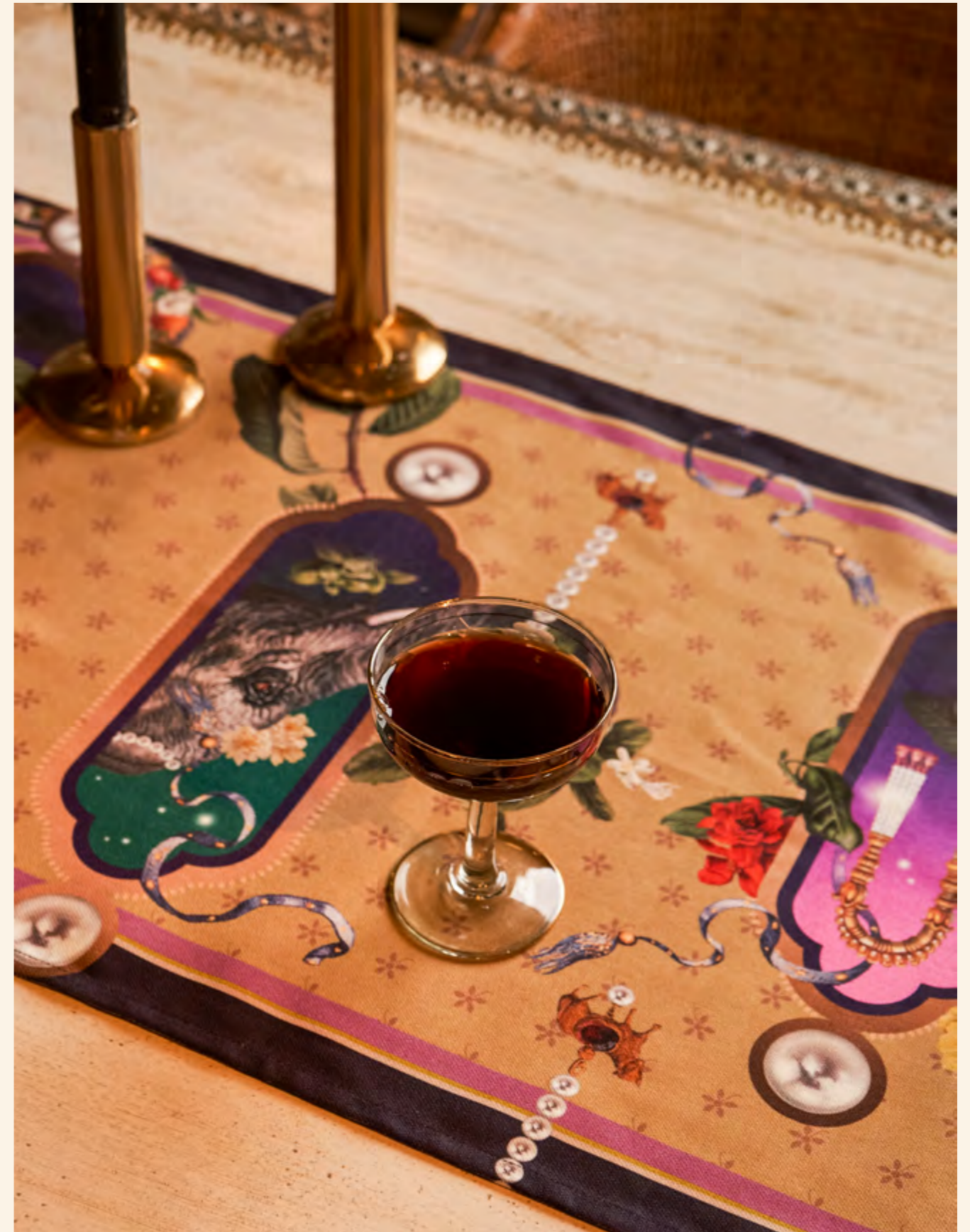
Sand India Table Runner