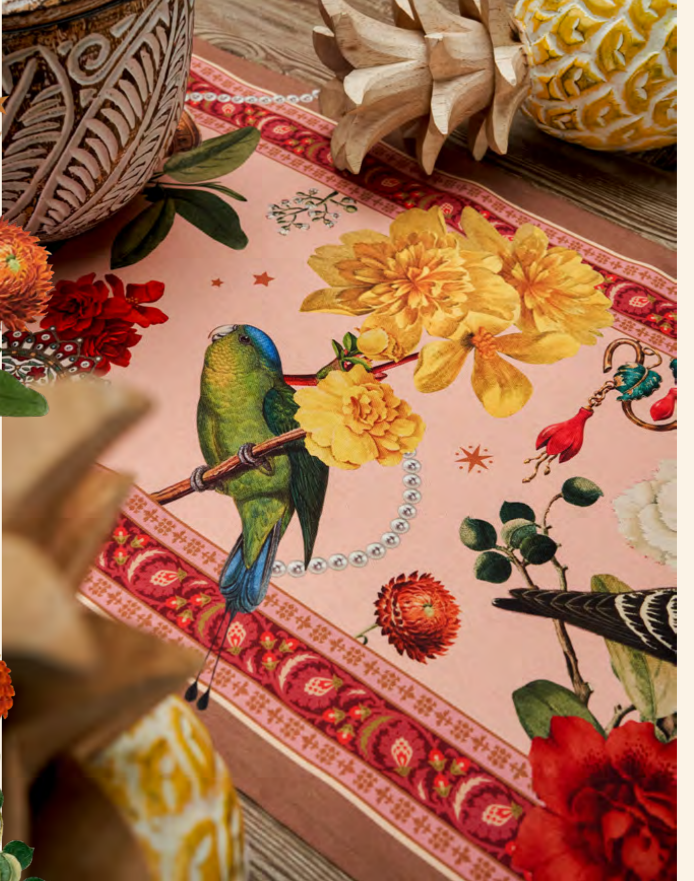
Rama Table Runner