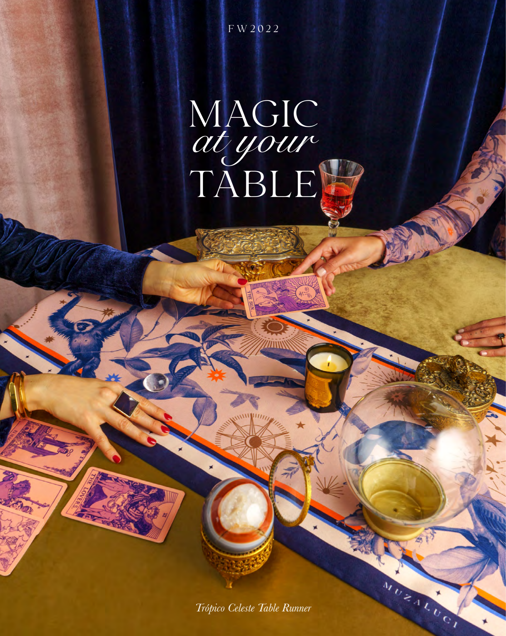
Trópico Celeste Table Runner