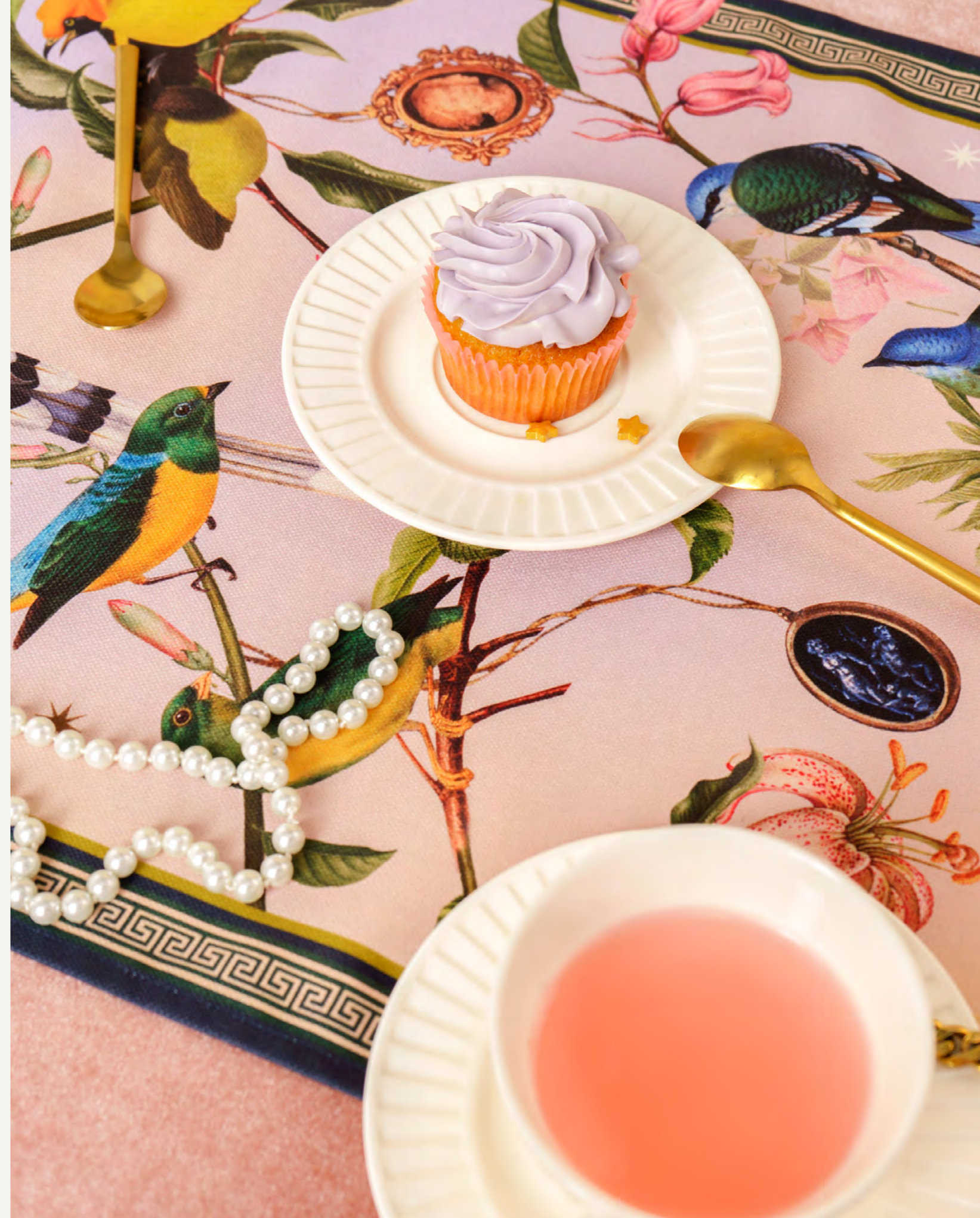
Alegria Table Runner