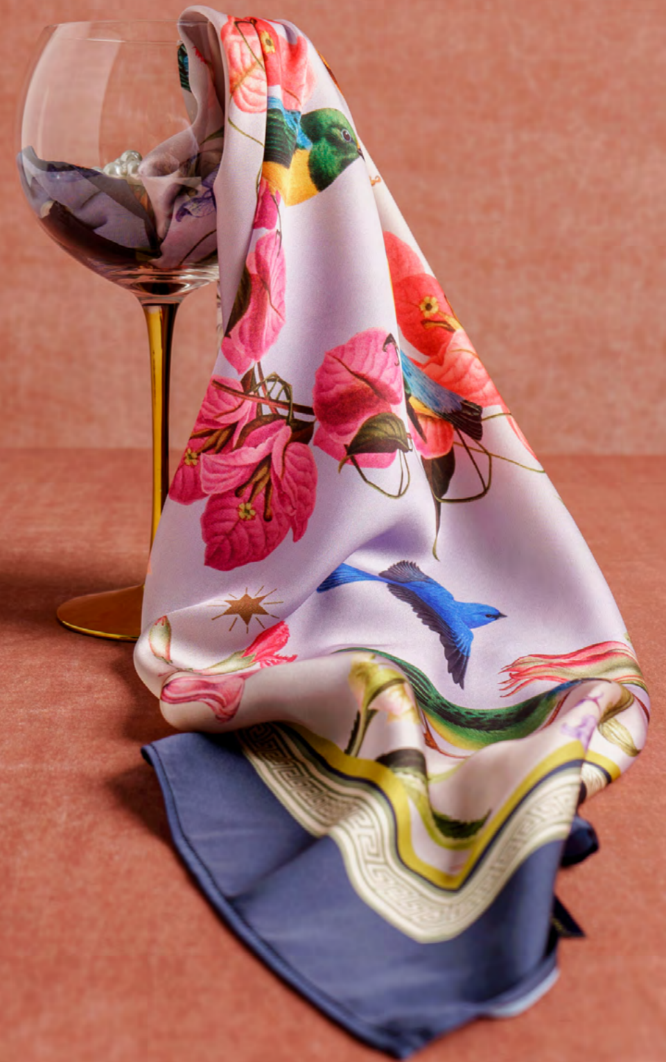
Alegría Silk Sattin Scarf