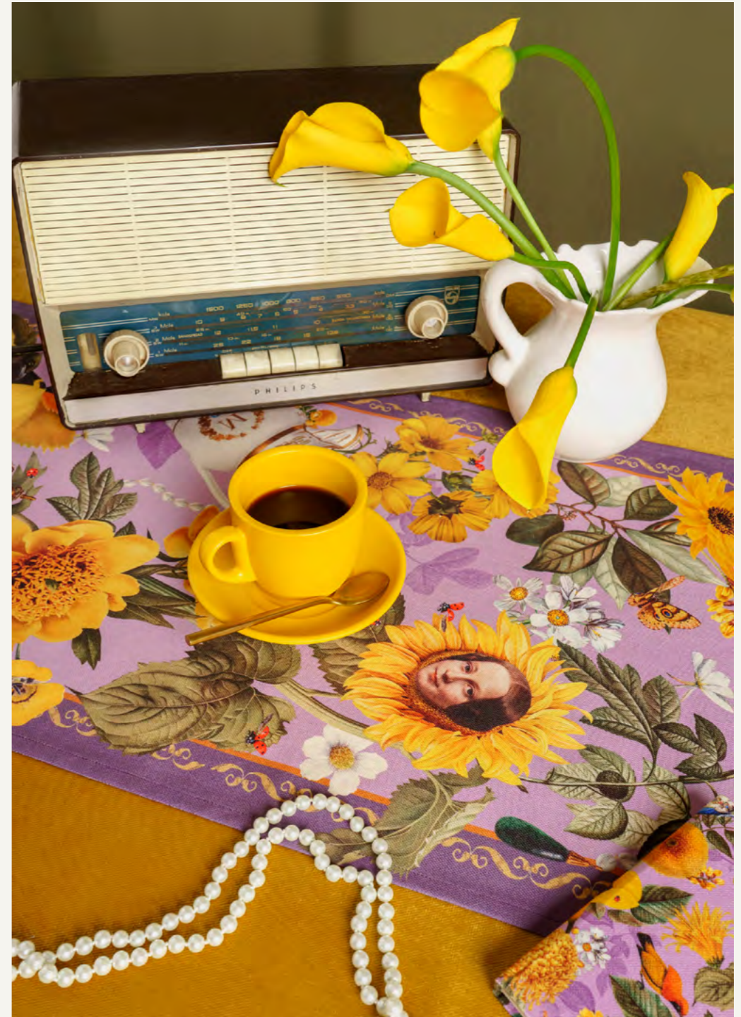
Sunflower Table Runner