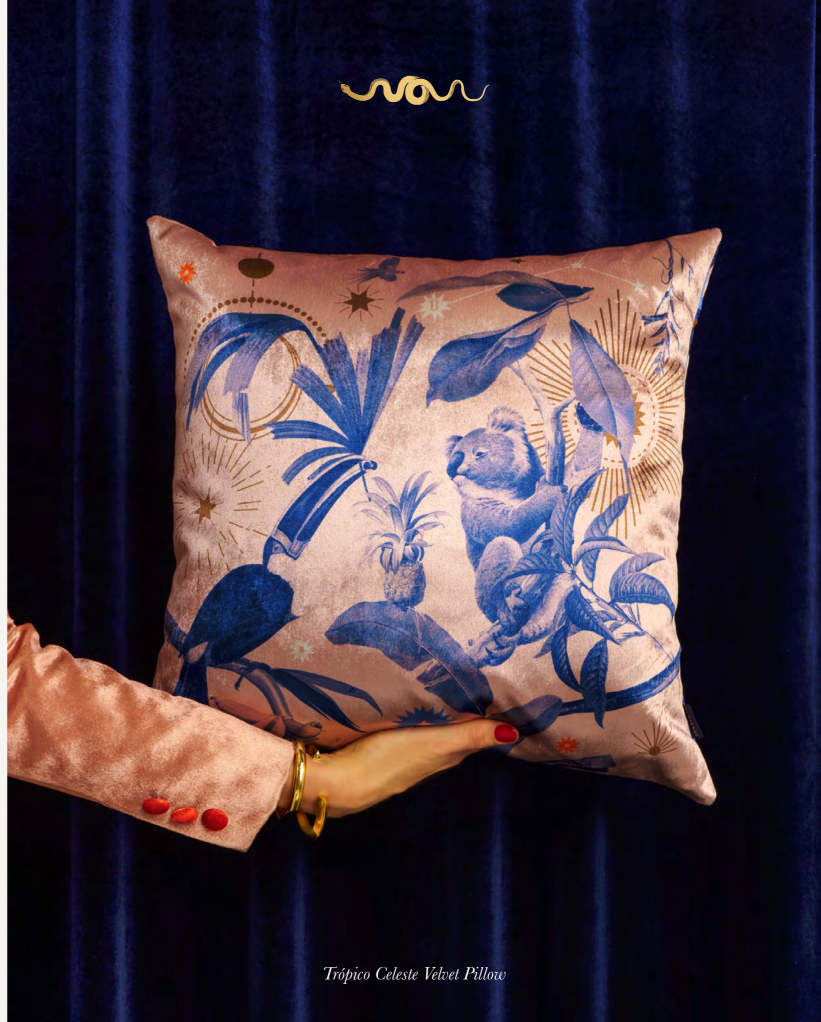
Trópico Celeste Velvet Pillow