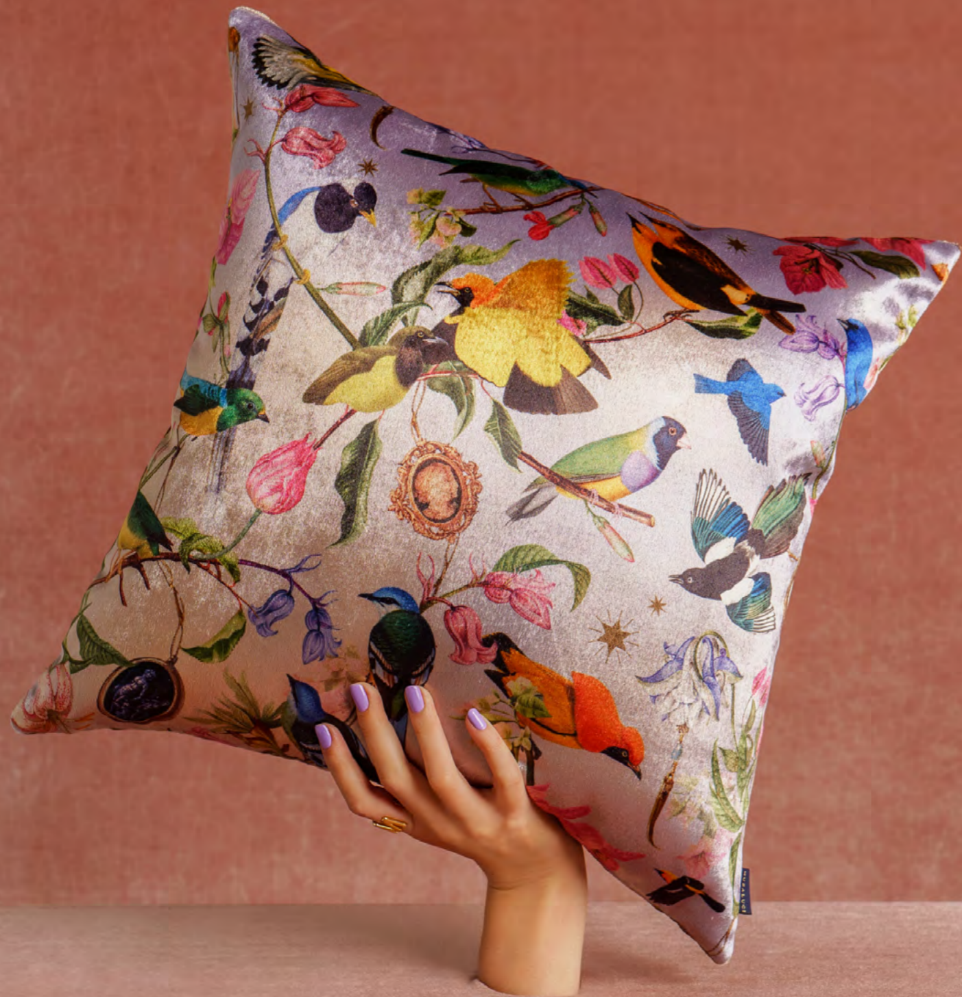
Alegria Velvet Pillow