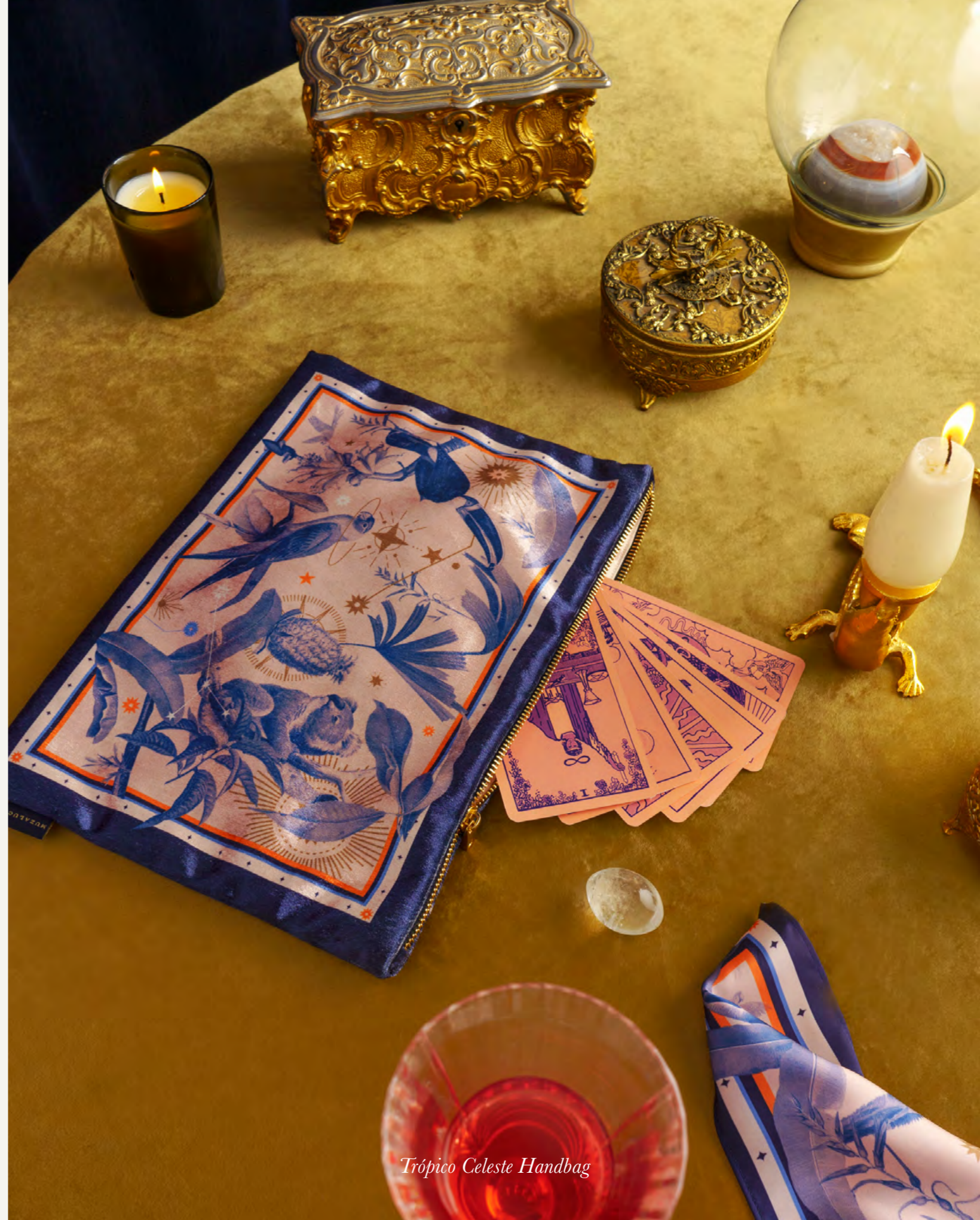
Trópico Celeste Handbag

A tropical inspired mix of magnificent textures and colors full of mysticism