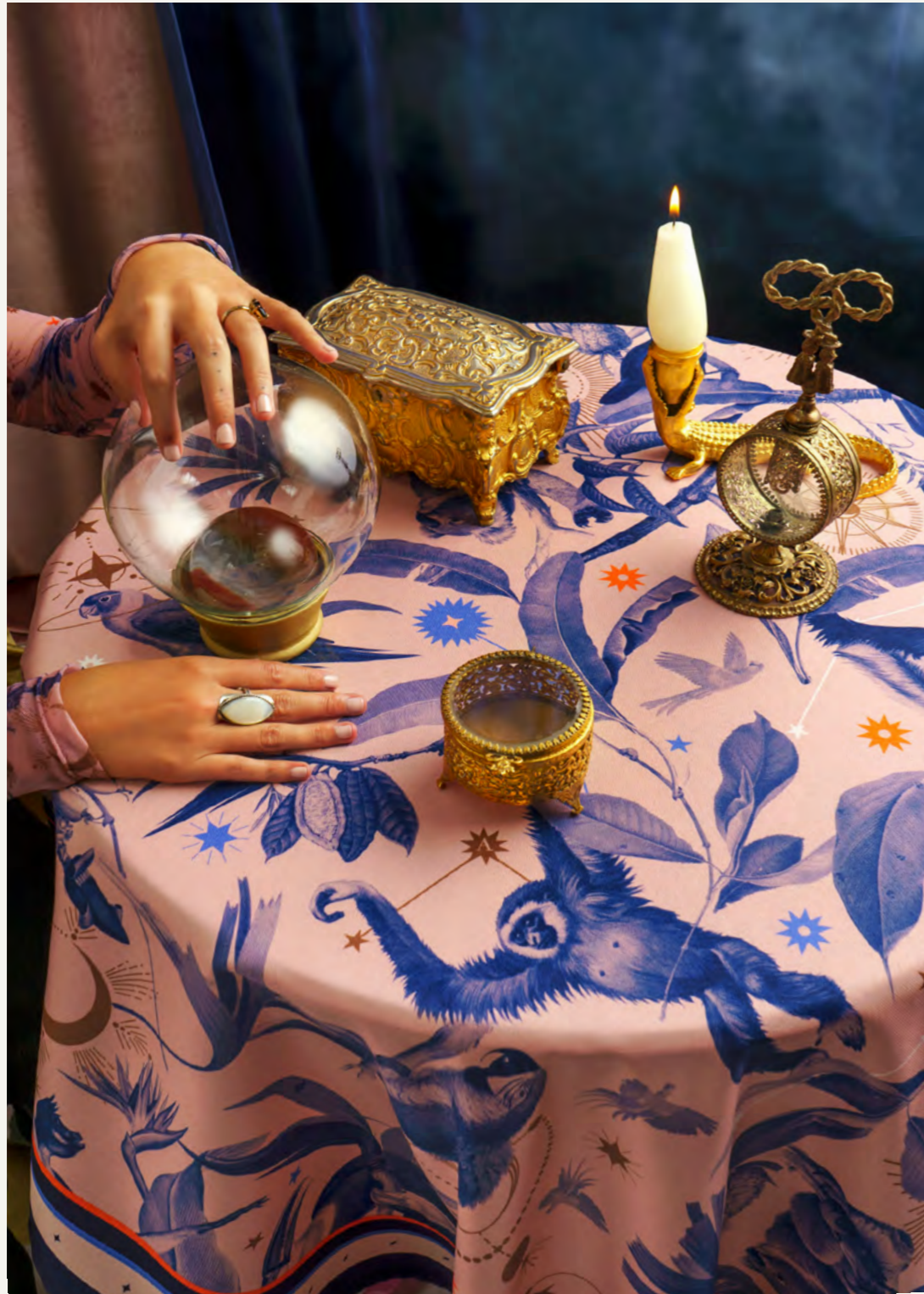
Trópico Celeste Tablecloth

A tropical inspired mix of magnificent textures and colors full of mysticism