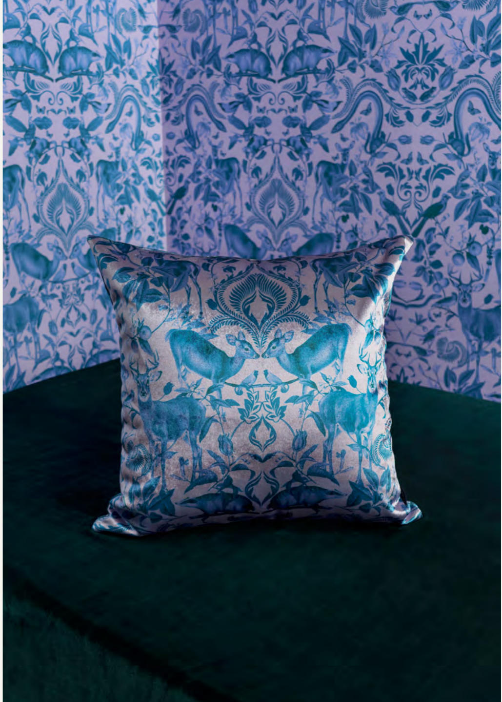
Lilé Velvet Pillow

Our Velvet pillows are the best finishing touches for a space filled with warmth and visual interest