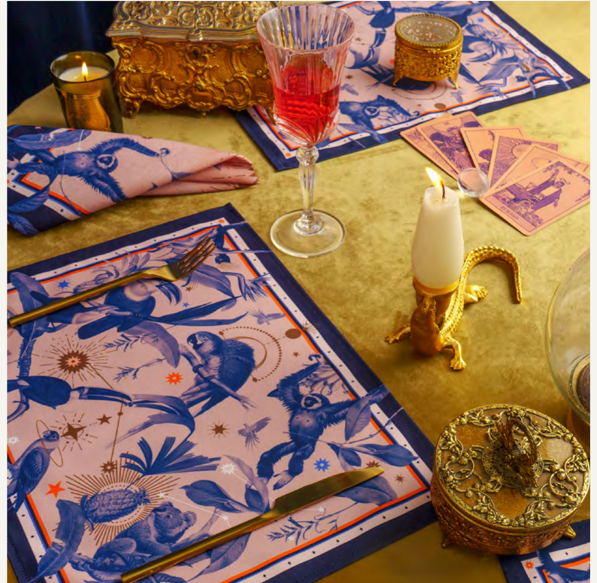
Trópico Celeste Placemats