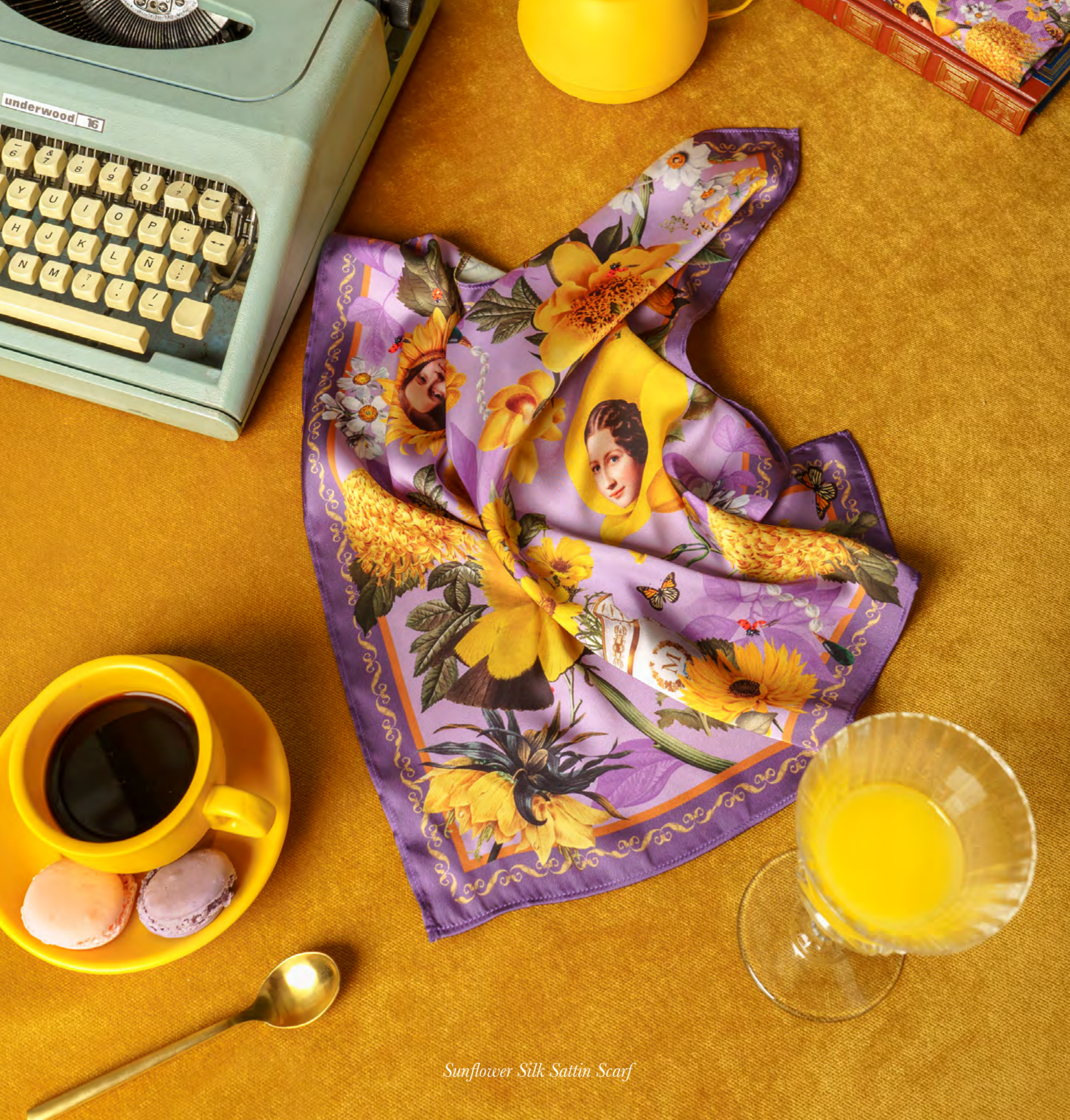
Sunflower Silk Sattin Scarf