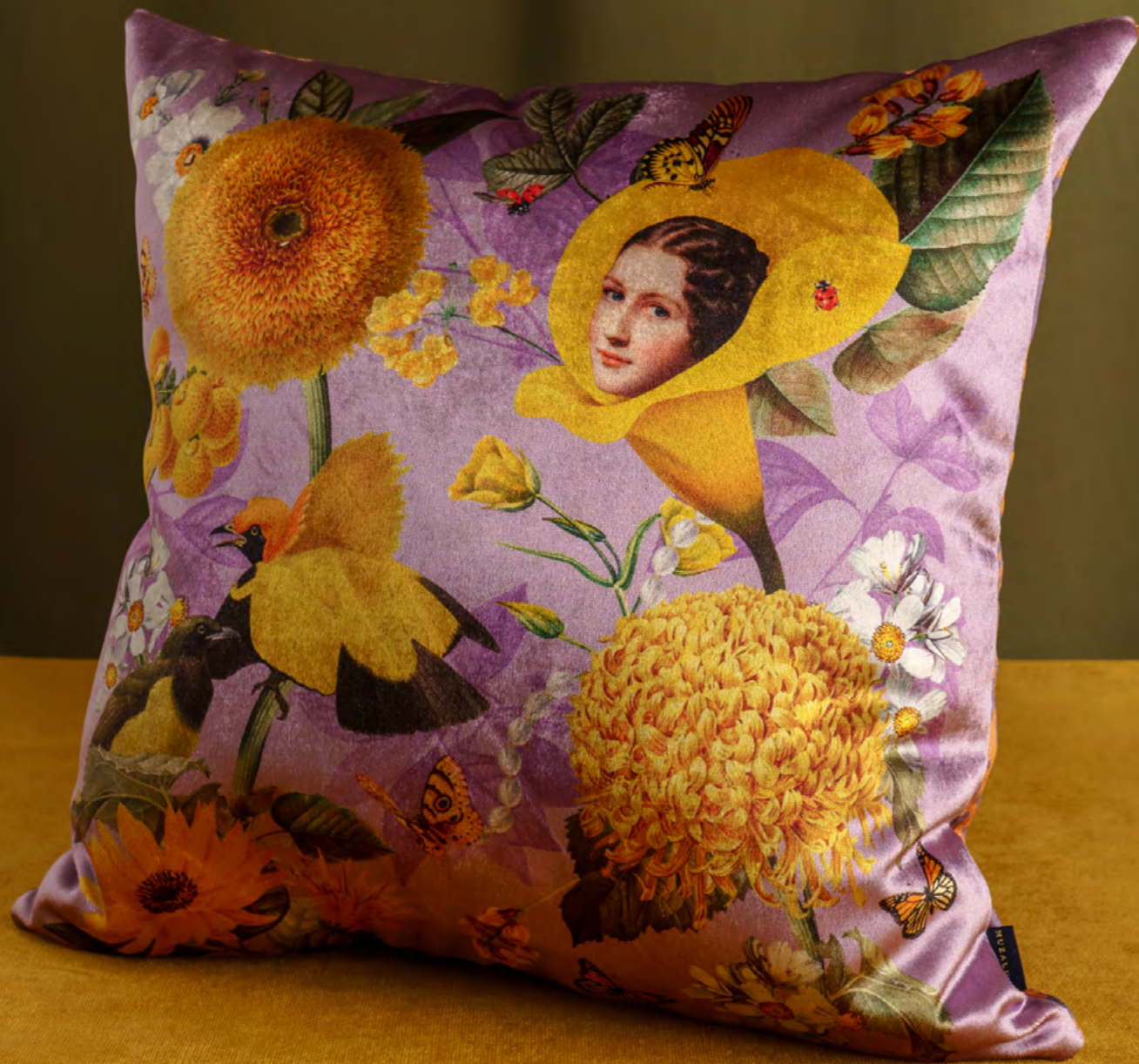
Sunflower Velvet Pillow