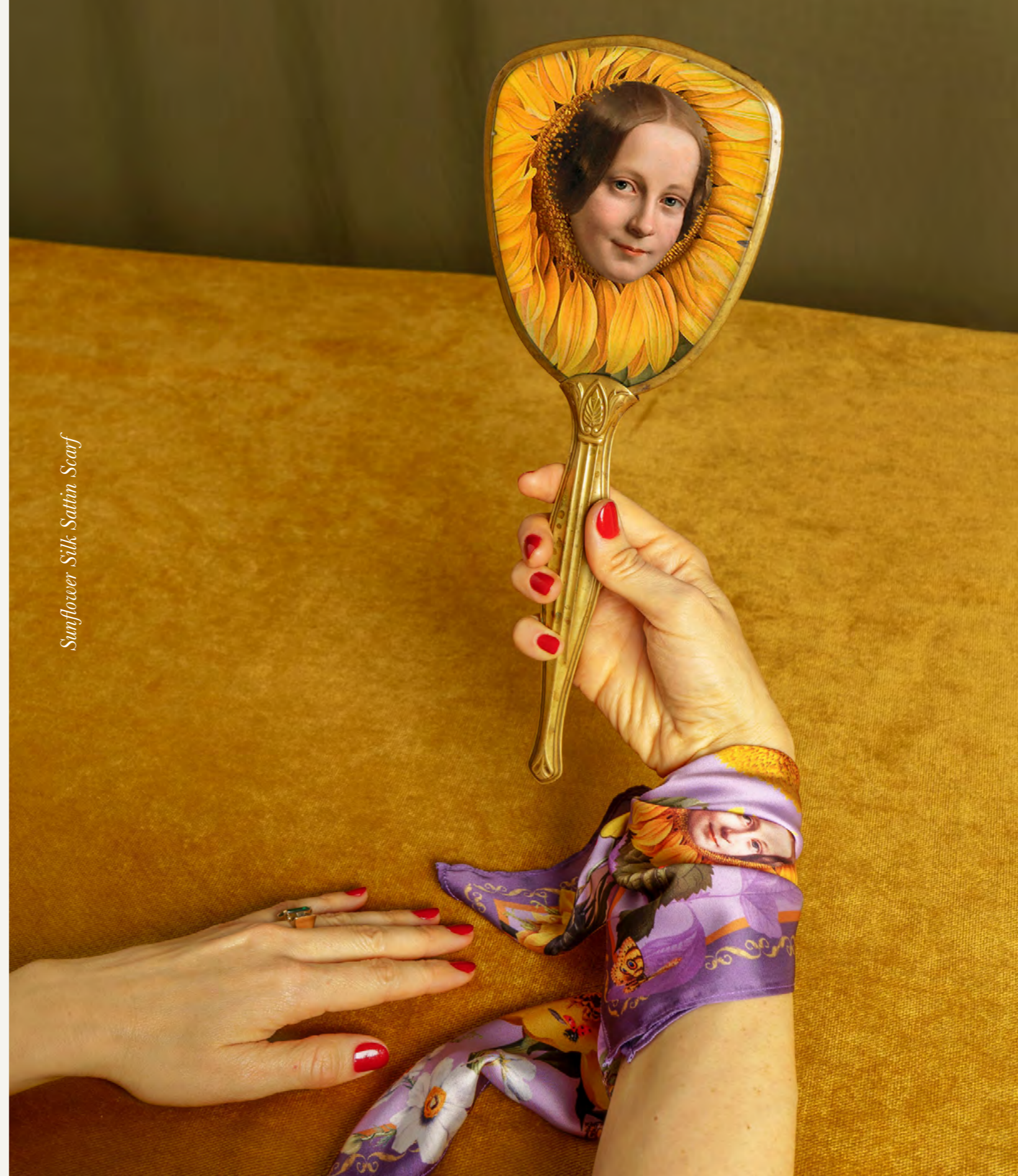
Sunflower Silk Satin Scarf