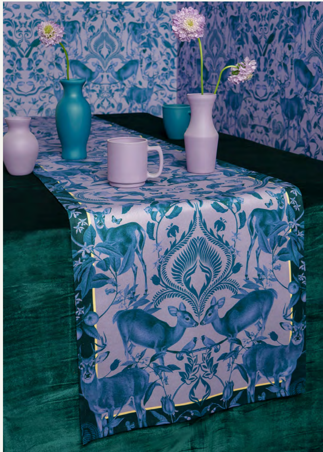
The chicest little corner