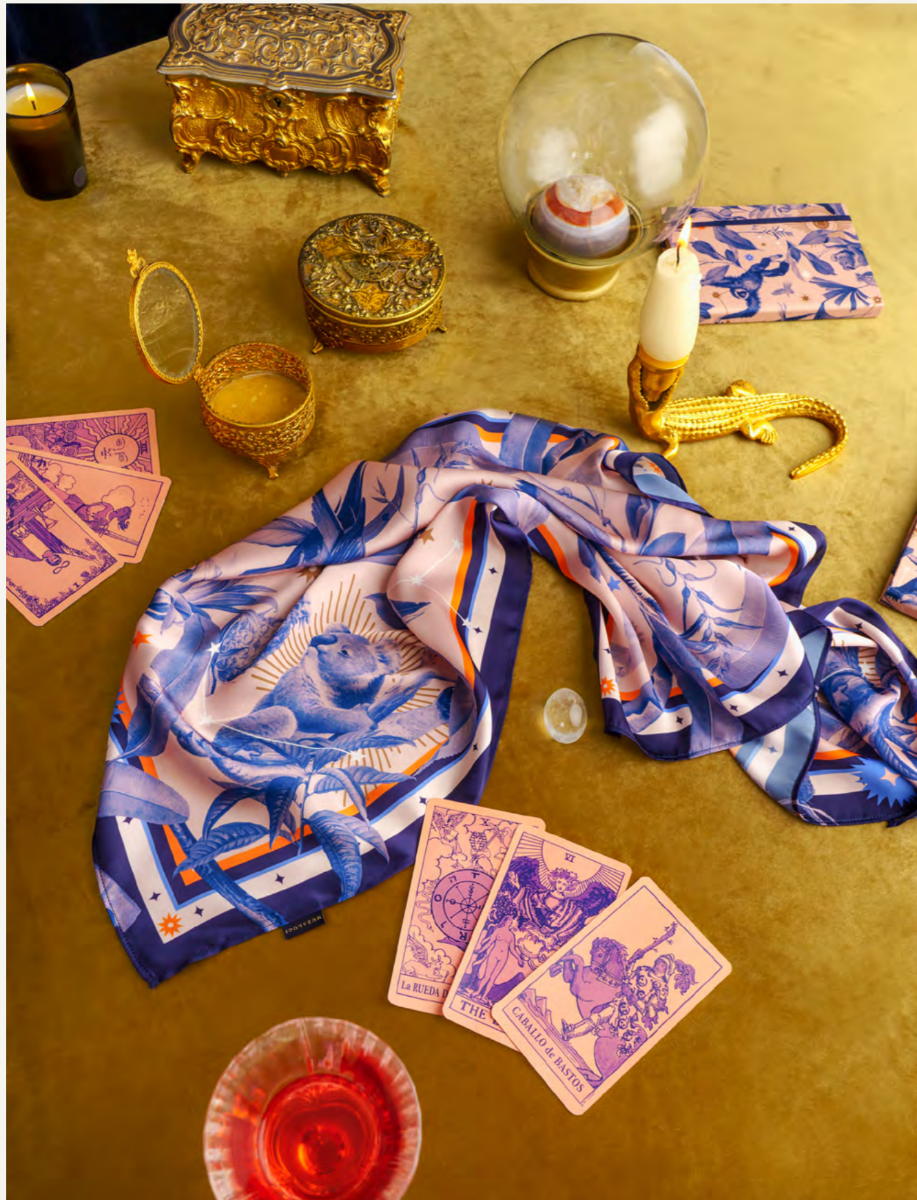
Trópico Celeste Scarf