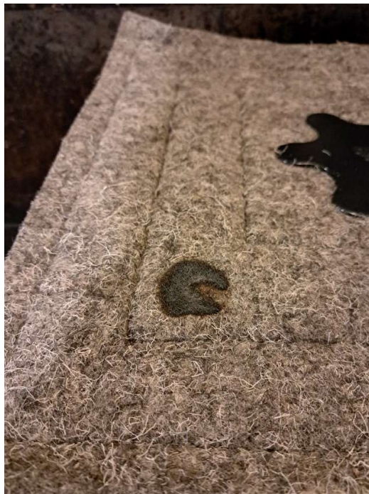
Resultant burn marks after ignition source# 2 test