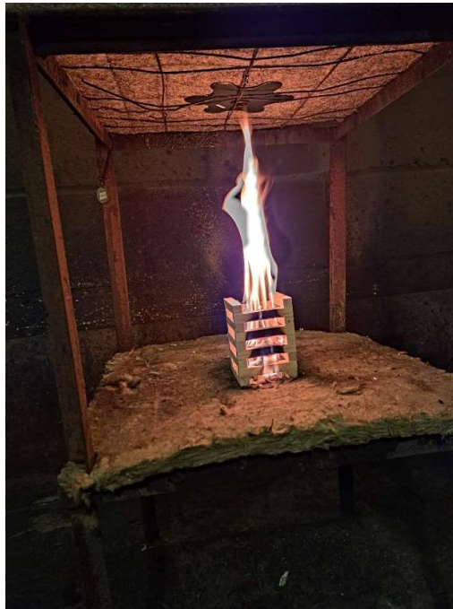
Showing crib 7 ignition source below chimney sheep.