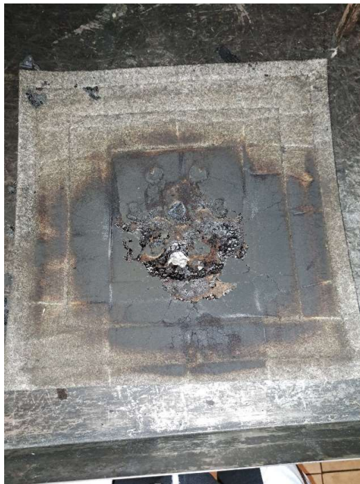
Showing burned underside of chimney sheep after crib 7 test.