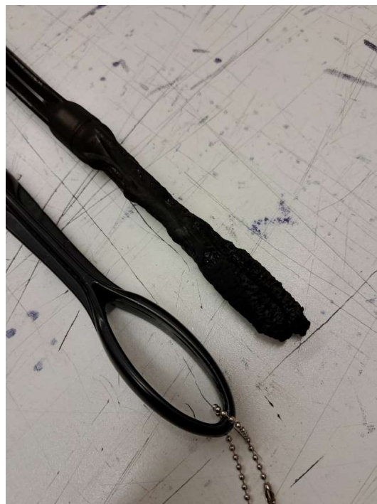
Showing undamaged handle and hang tag and damaged handle after test.