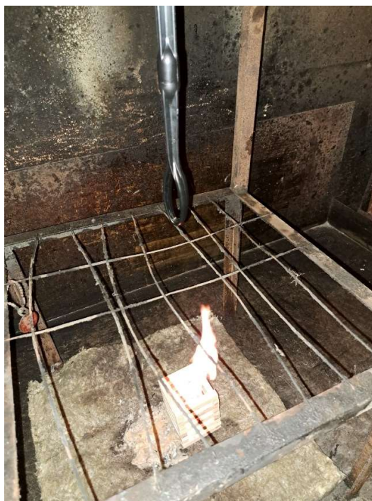
Showing crib 7 test with handle and hang tag in position.