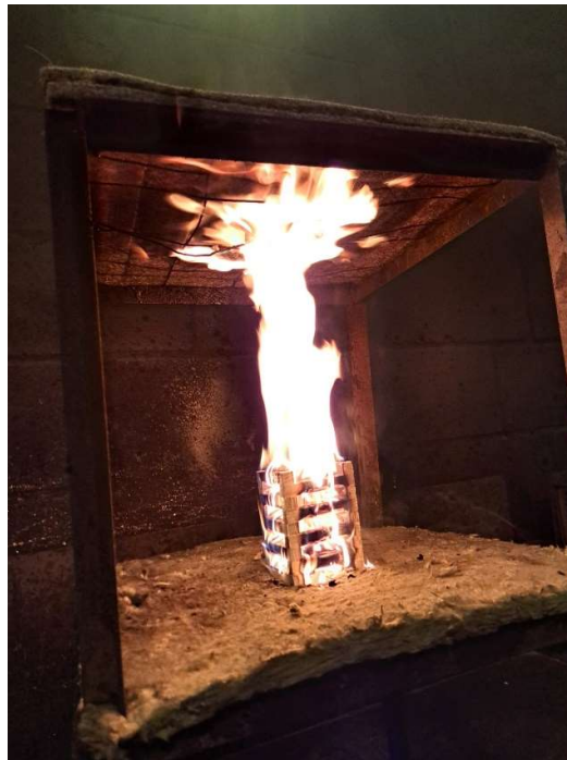
Showing crib 7 ignition source flames on underside of chimney sheep. (without handle present)