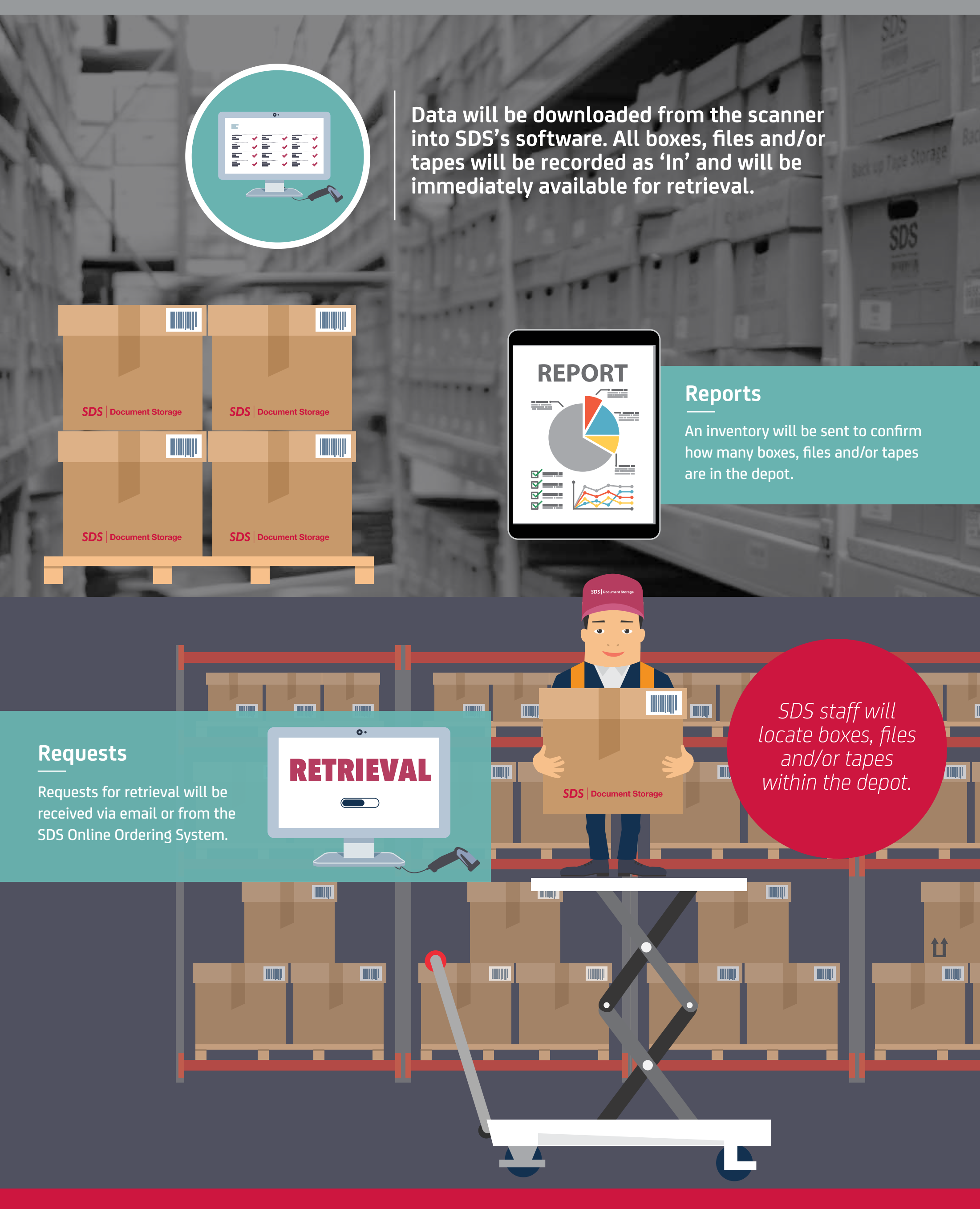
SDS STAFF WILL SCAN THE BOXES, FILES AND/OR TAPES 'OUT'.