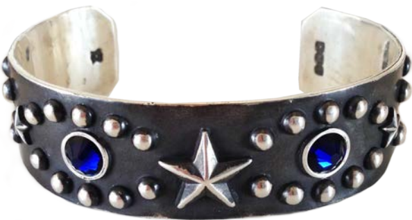
15AO-327 Shooting Star Studs Bangle

silver plated brass & swarovski size : M