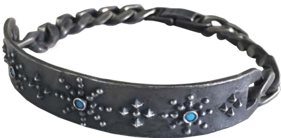
Silver Plated Brass & Swarovski Size : M