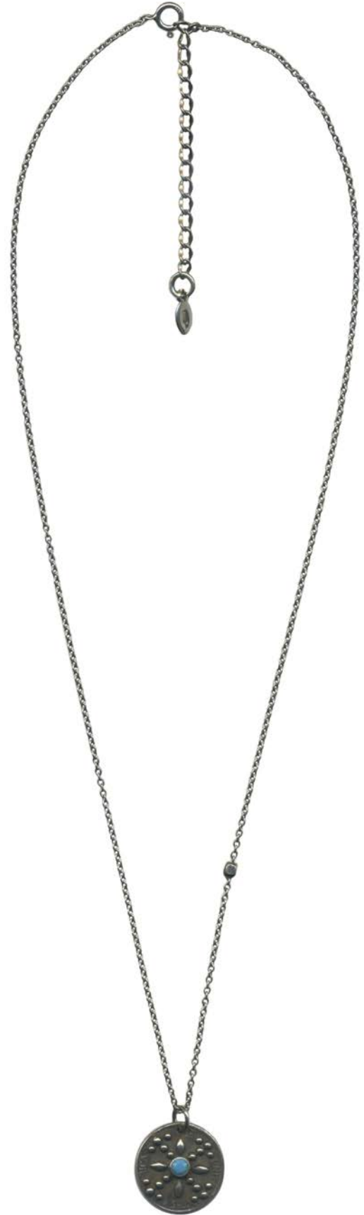
Top:Silver Plated Brass & Swarovski Chain:Stainless, Brass Beads,Titanium,Silver Parts & Silver Charm Size : 45~50cm