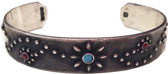
15AO-326 Flower Studs Bangle

silver plated brass & swarovski size : M