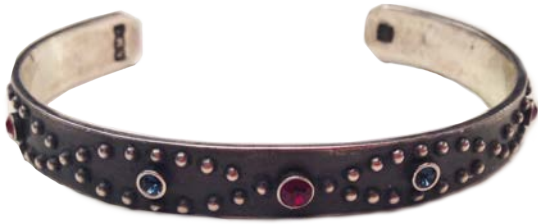
15AO-325 Classic Studs Bangle -Narrow-

silver plated brass & swarovski size : M