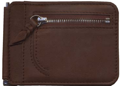
(color : BROWN) leather