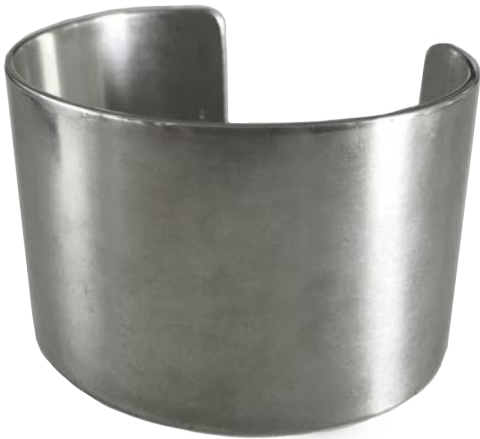
German Silver / Size : M