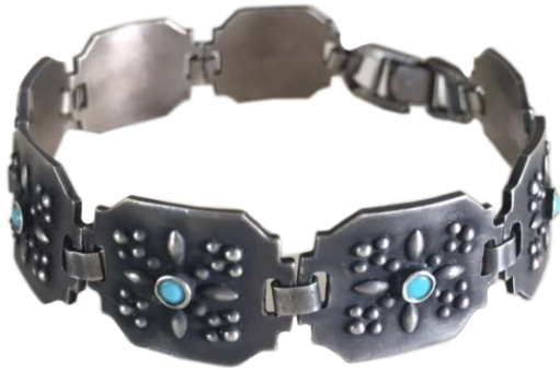
Silver Plated Brass & Swarovski Size : M