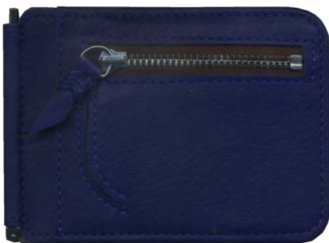
(color : NAVY) leather