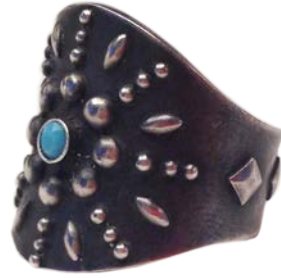
15AO-230 Radial Studs Ring

silver plated brass & swarovski #15 (free)