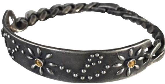
Silver Plated Brass & Swarovski Size : M