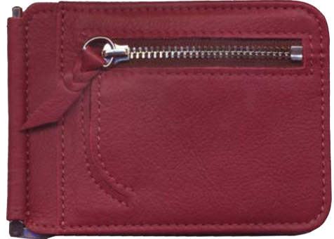
(color : RED) leather