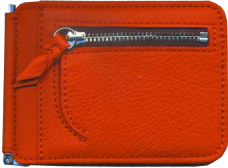
(color : ORANGE) leather