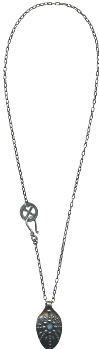
15AO-115 Radial Studs Necklace

top & chain: silver plated brass stone: swarovski 50cm