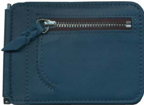
(color : BLUE) leather