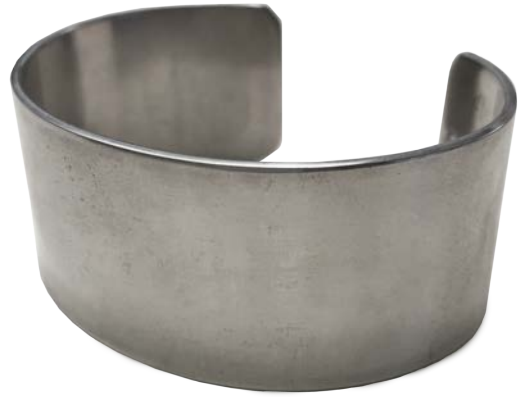
German Silver / Size : M