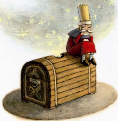
Illustration copyright © 2007 by Kelly Murphy