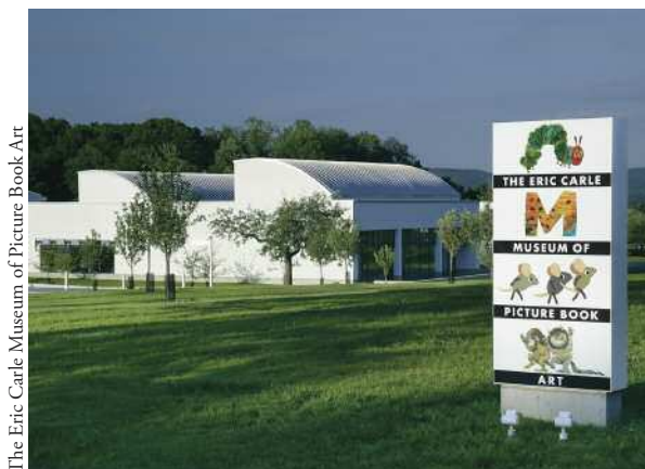
The Eric Carle Museum of Picture Book Art