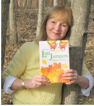
Photograph and biographical information courtesy Carole Gerber and Charlesbridge Publishing, Inc.; used with permission.