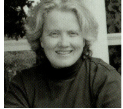
Biographical information courtesy Charlesbridge Publishing, Inc.; used with permission.