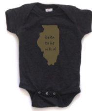
Vintage Color Bodysuit