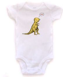
T-rex dreaming of bacon