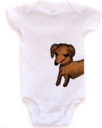
Dachshund (wraps around)