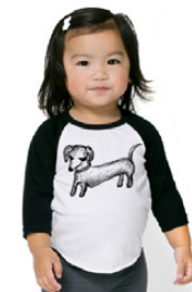
3/4 sleeve Baseball T