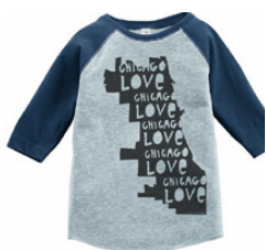
Kid's Baseball T