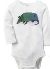
White LS Bodysuit