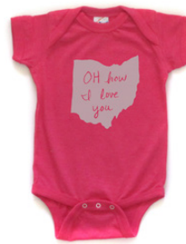
OH how I love you (all states available)