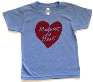
Midwest is Best - definitely a bestseller!