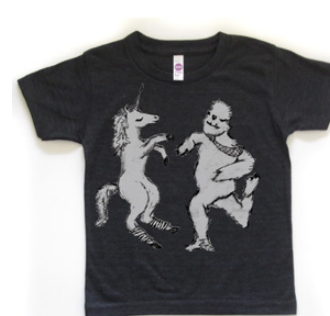
Uni & Yeti