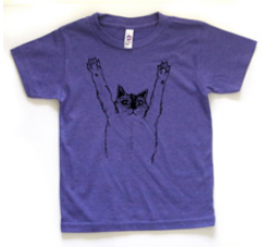
Kid's Tri-Blend T