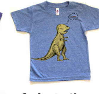
T-rex Dreaming of Bacon