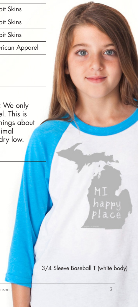
3/4 Sleeve Baseball T (white body)