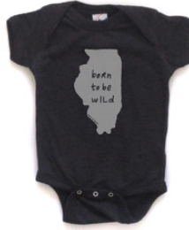
Born to be wLd (Illinois)