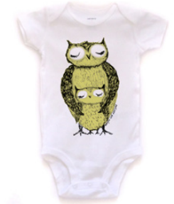
Owl family - NEW