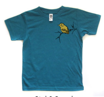
Bird & Branch