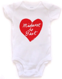
Midwest is Best