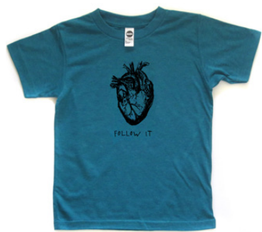
Follow It Heart