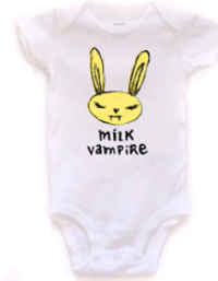
NEW Milk Vampire