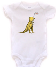
White SS Bodysuit