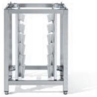
AX-501 OVEN STAND SHIP WT: 43 lbs