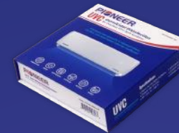
UVC Bacterial Disinfection Kit