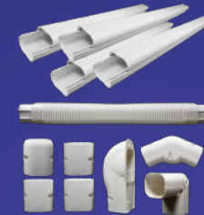
Line Cover Kit