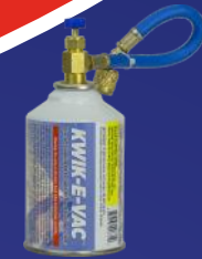
Line Set Flushing Kit