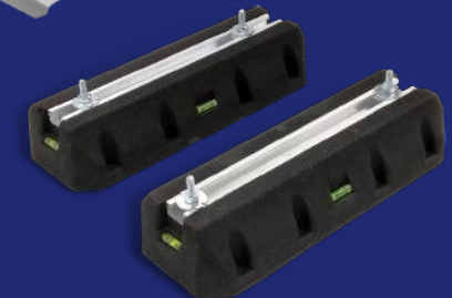
Floor Mounting Base Kit