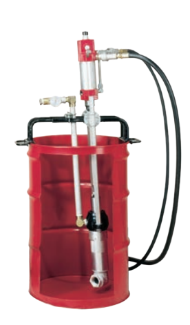
Hydra M 4000 Remote 433-802