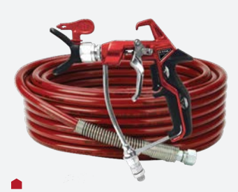
The PowrTwin 8900 Plus comes complete with S-5 Gun, 517 TR1 Reversible Tip and 1/4" x 50' Airless Hose.

Dependable, gas-powered engine with low-oil alert.