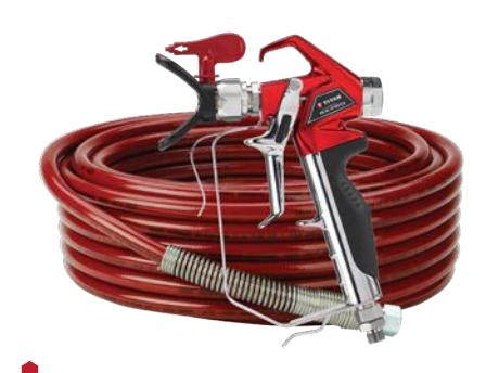
The Elite 3500 comes complete with RX-Pro Gun, 517 TR1 Reversible Tip and 1/4" x 50' Airless Hose.