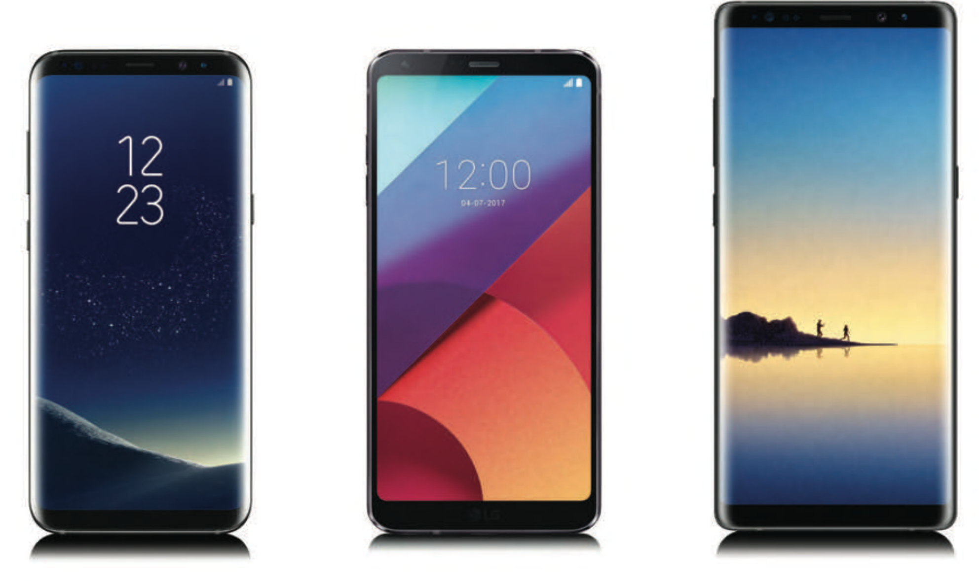
Samsung Galaxy S8

Choose from an incredible selection of smartphones on Canada's best national network<sup>1</sup>.