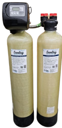
Front View of System