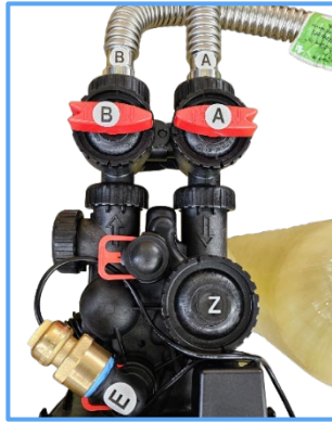
Top view of Catalytic Carbon Blend Tank