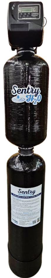
Catalytic Carbon Blend Tank