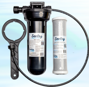
Sentry Scale Control Kit: