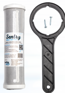
Sentry Scale Control Filter: