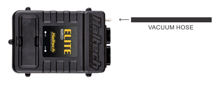
Figure 1 - Elite ECU internal MAP sensor

PLEASE CONNECT THE ELITE ECU INTERNAL MAP SENSOR TO THE INTAKE MANIFOLD PRIOR TO STARTING THE VEHICLE.