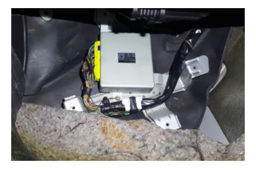
Figure 2 - ECU Location

REMOVING THE PROTECTIVE PLATÉ WILL ALLOW SPACE TO INSTALL THE HALTECH ASSEMBLY. ALL FACTORY PANELS MAY BE RE-USED AFTER INSTALLATION.