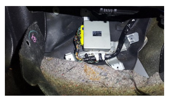
Figure 3 - Factory ECU is now ready for removal.