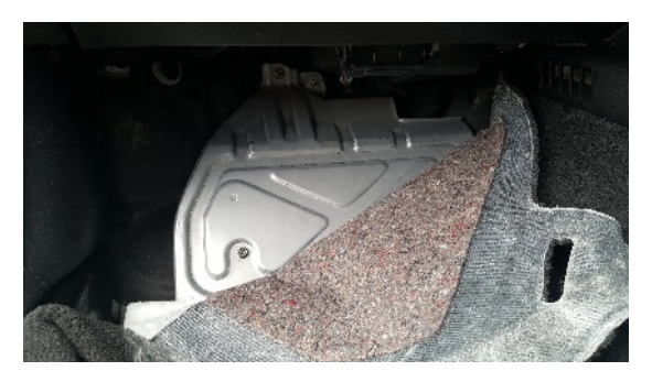
Figure 2 - Remove the panel by removing 4 nuts using a 10mm socket