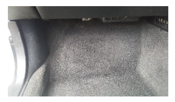
Figure 1 - Factory ECU located under the carpet, behind the floor panel.

THE FACTORY SUBARU WRX MY97-98 ECU IS LOCATED BEHIND THE PASSENGER SIDE FLOOR PANEL (RIGHT-HAND DRIVE (RHD) MODELS). REMOVING THE FLOOR PANEL WILL ALLOW FOR THE INSTALLATION OF THE ECU AND THE ADAPTOR HARNESS. ALL FACTORY PANELS MAY BE RE-USED AFTER INSTALLATION.